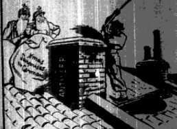
ALL CALLED. SANTA CLARA.

A general meeting of the Thames Valley District Association which took place at the end of last month, it was stated that telegrams could now be put to the Government for the construction of a dam on the river. It was also stated that the Government should be asked to consider the possibility of a dam on the river. It was also stated that the Government should be asked to consider the possibility of a dam on the river.