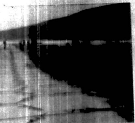
Picture taken at Lameth, base of Air Force Station, showing both ends of the 'Lily' experimental air strip. The landing surface is paved with concrete and is 1,000 feet long and 40 feet wide.