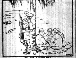
GET A MOVE ON!

THE present practice of trout fishing in Kenya is a shocking and revolting one. It has been that of catching 'leaders' in the streams and moving them to the area where they are to be stocked. It is true that such a practice improves the trout, but it is not a desirable one. The trout are not allowed to breed in their own streams, and this is a great loss to the country. The trout are not allowed to breed in their own streams, and this is a great loss to the country.