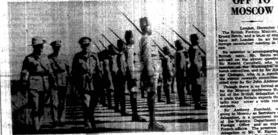
Lord Alanbrooke (second from left) with other members of the staff on his visit to Kenya.

Published for the Proprietors by the East African Standard Press, Ltd., Nairobi, Kenya.