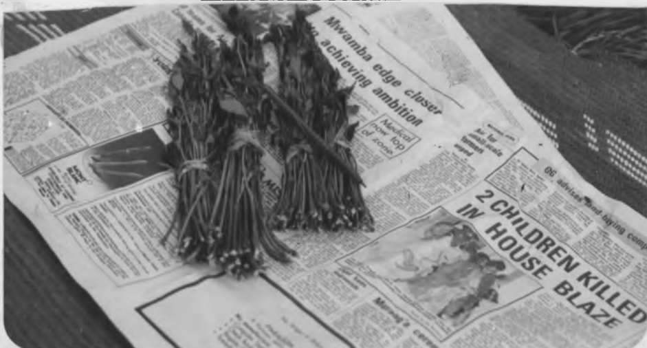
Photograph No. 4 Two Kilos of Khat