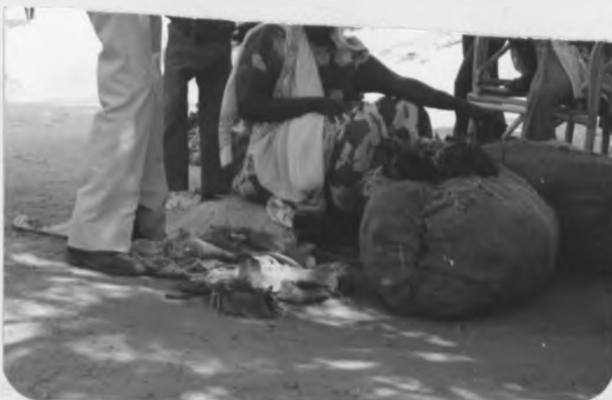
Photograph No. 6 : A SACK OF KHAT