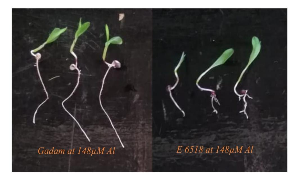
Figure 3.2: Effects of 148µM Al on root growth and development. Tolerant genotype Gadam has longer roots compared to sensitive E 6518.

Generally, there was considerable reductions on the rate of development of lateral roots in both resistant and susceptible sorghum genotypes grown in solution culture with Aluminium (Figure 3.3). This further revealed the impacts of toxicity of Al^{3+} on root growth and development. Complete reduction in root volume among highly sensitive genotypes finally restricts plants from efficiently accessing water and mineral nutrients from the rhizosphere hence poor growth and eventually yield and quality of the produce.