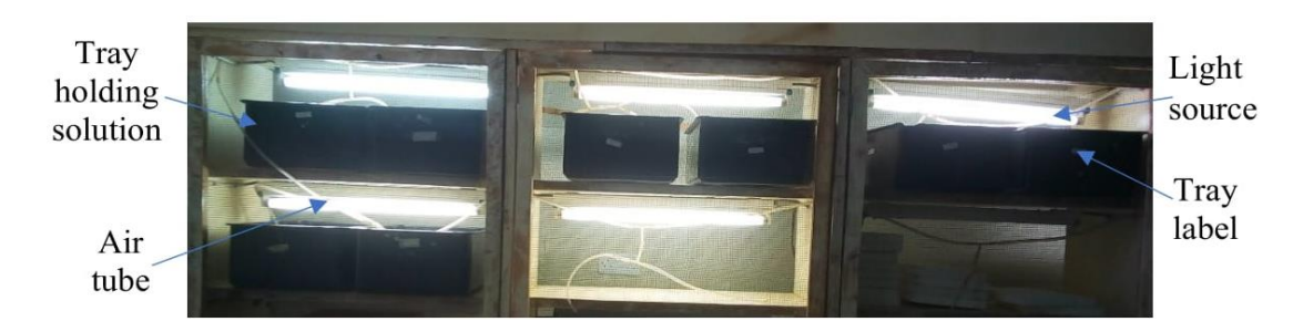
Figure 3.1: Screening chamber installed with trays holding screening solution, light source and air tubes supplied by an electric air pump.