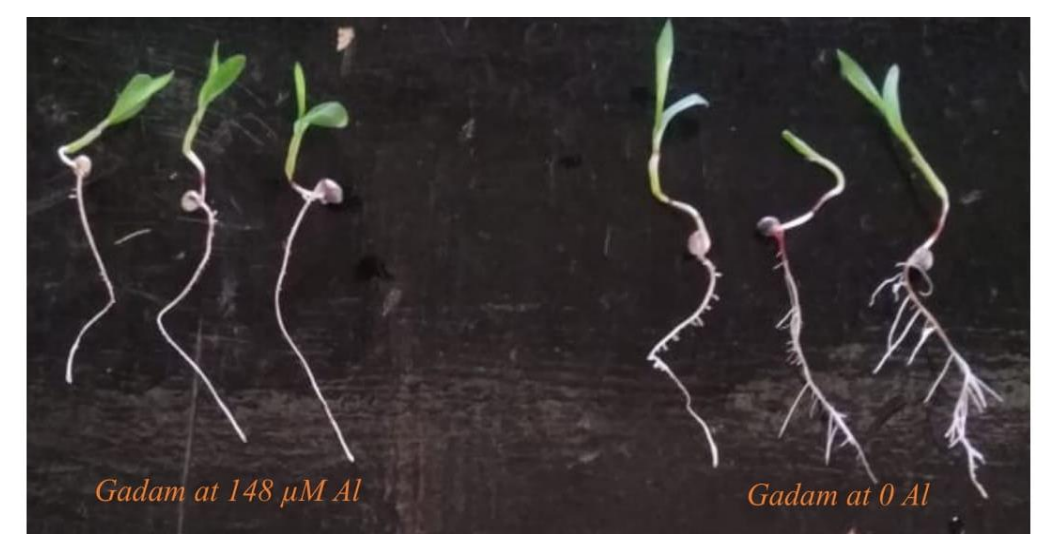
Figure 3.3: Effects of Aluminium on root lateralization/ branching. Genotype Gadam at 0 µM Al has developed lateral roots at higher rate unlike at 148µM Al.

Generally, there was considerable reductions on the rate of development of lateral roots in both resistant and susceptible sorghum genotypes grown in solution culture with Aluminium (Figure 3.3). This further revealed the impacts of toxicity of Al^{3+} on root growth and development. Complete reduction in root volume among highly sensitive genotypes finally restricts plants from efficiently accessing water and mineral nutrients from the rhizosphere hence poor growth and eventually yield and quality of the produce.