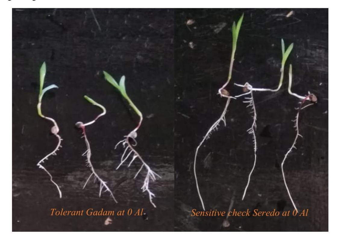
Figure 3.4: Root growth and development performance for tolerant and sensitive genotype in solution culture without Aluminium ( 0\mu M Al). Seredo an Al sensitive genotype has longer roots compared to the tolerant genotype Gadam.

At 0\mu M Al, some sensitive genotypes maintained higher root growth than a section of genotypes that were found to be tolerant to 148µM Al. For instance, genotypes KARI Mtama 1, E 1291 and Seredo a sensitive check scored significantly higher root growth rates in comparison to the tolerant genotypes at the same level of Al treatment (Table 3.4 and Figure 3.4). This further enhanced the understanding on limitations of Al toxicity to sorghum growth in acidic soils.