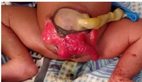
Figure 1. Illustration of exstrophy of the cecum between two exstrophied halves of the bladder and an imperforate anus.