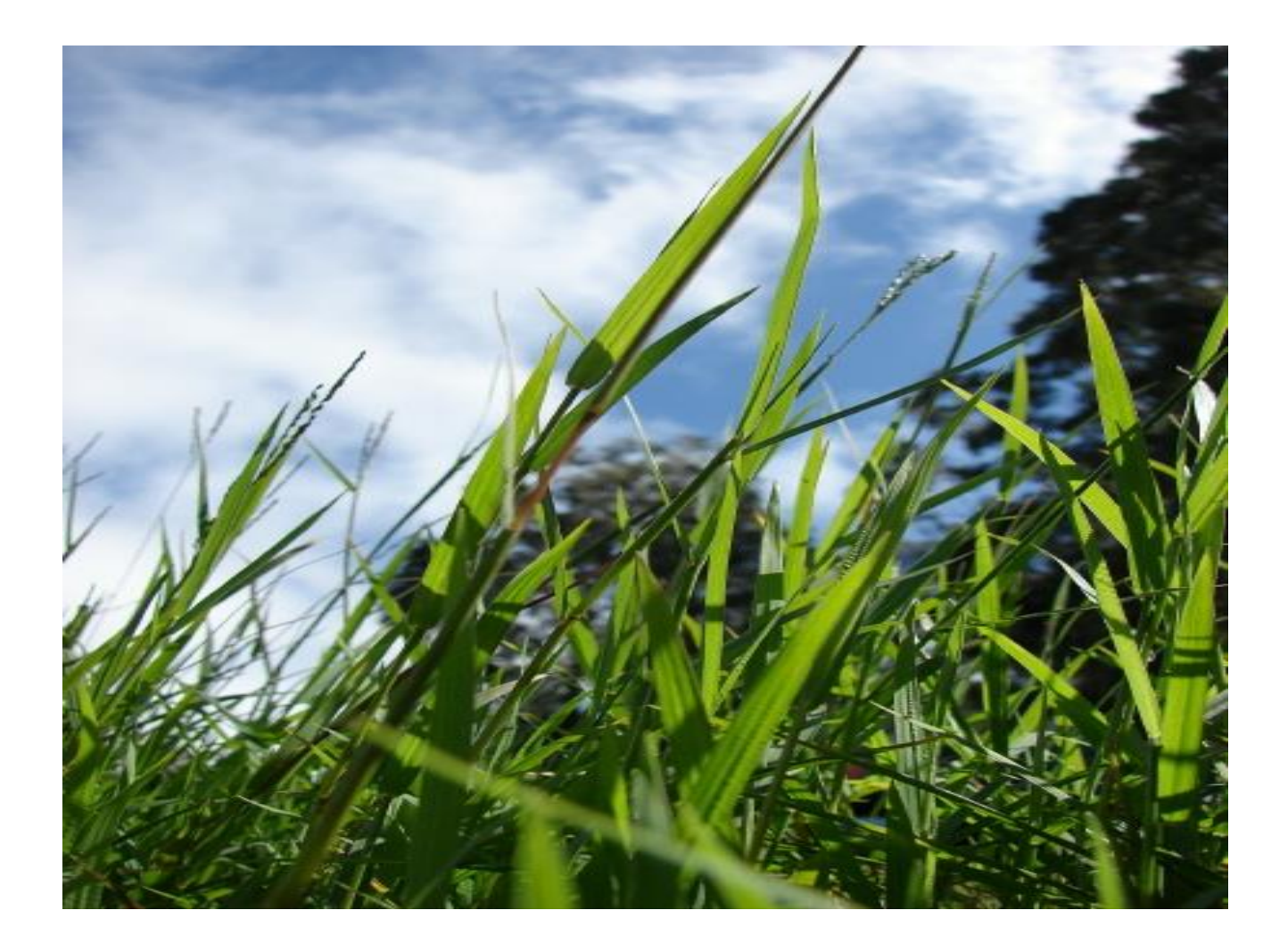
Figure 2.1: Digitaria abyssinica. (Forest and Kim Starr).