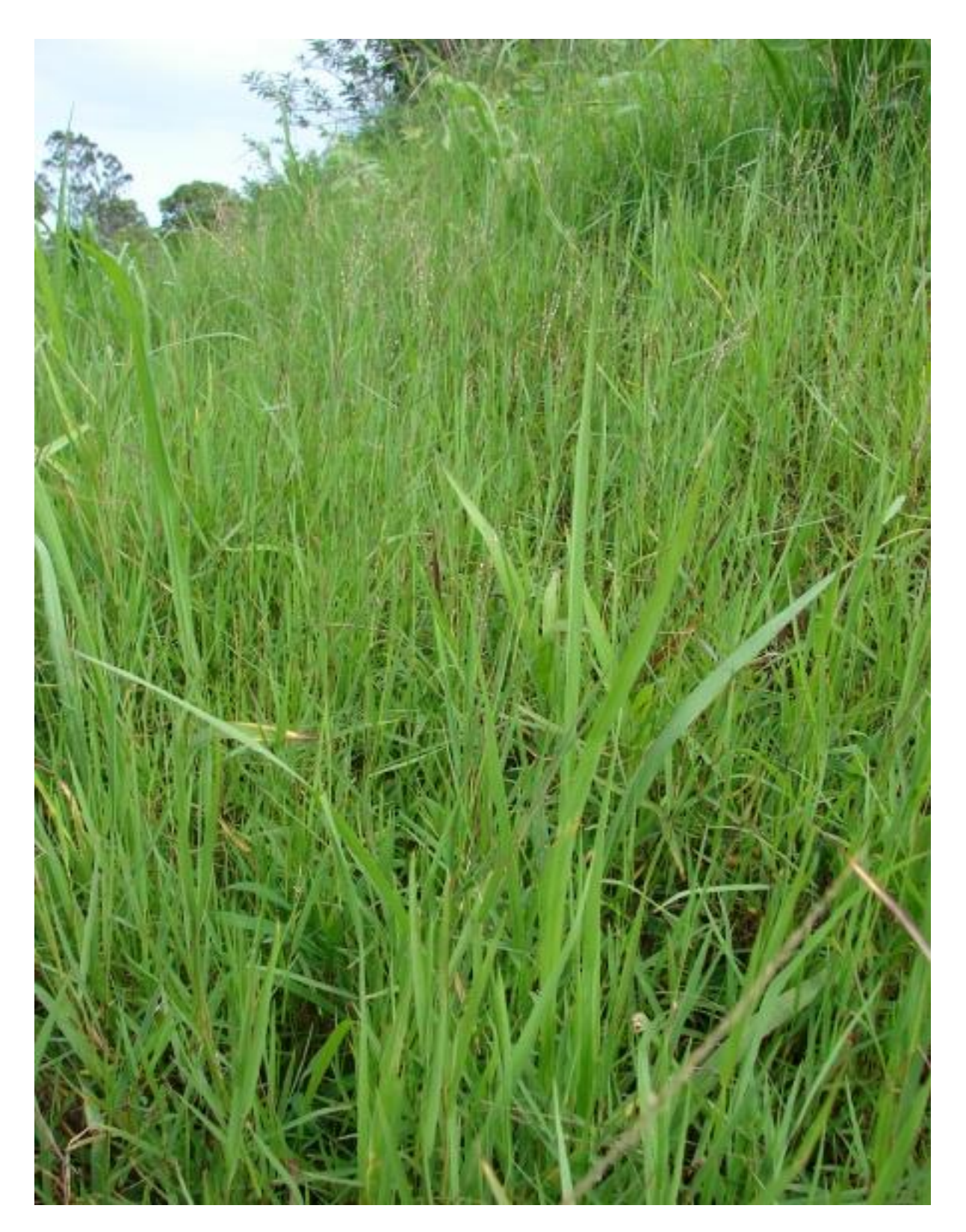
Figure 3.2: A photo of Digitaria abyssinica taken in Mua, Kyaani Machakos County, the study area.