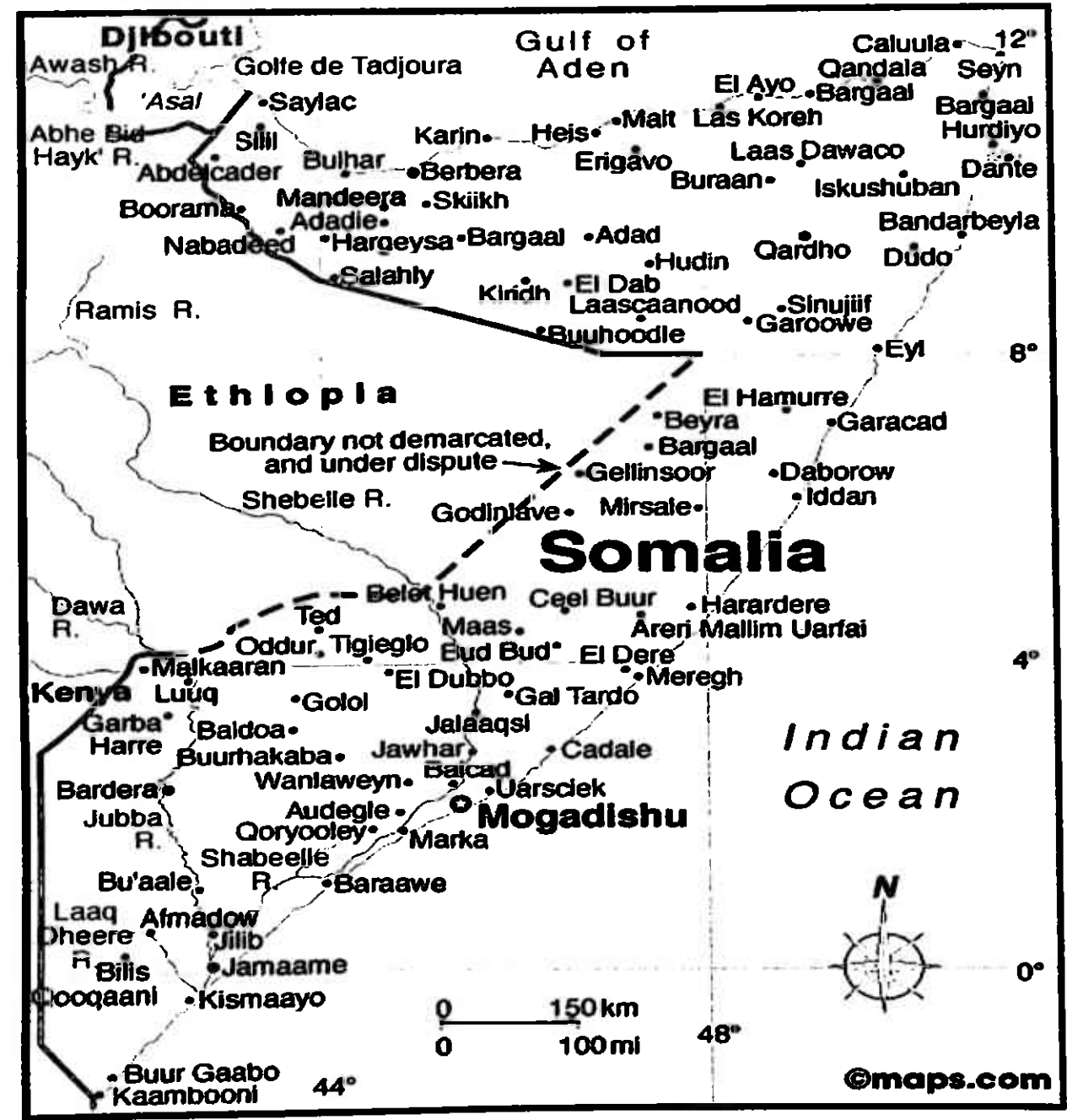
Map 2: Pre- 1991 Somalia