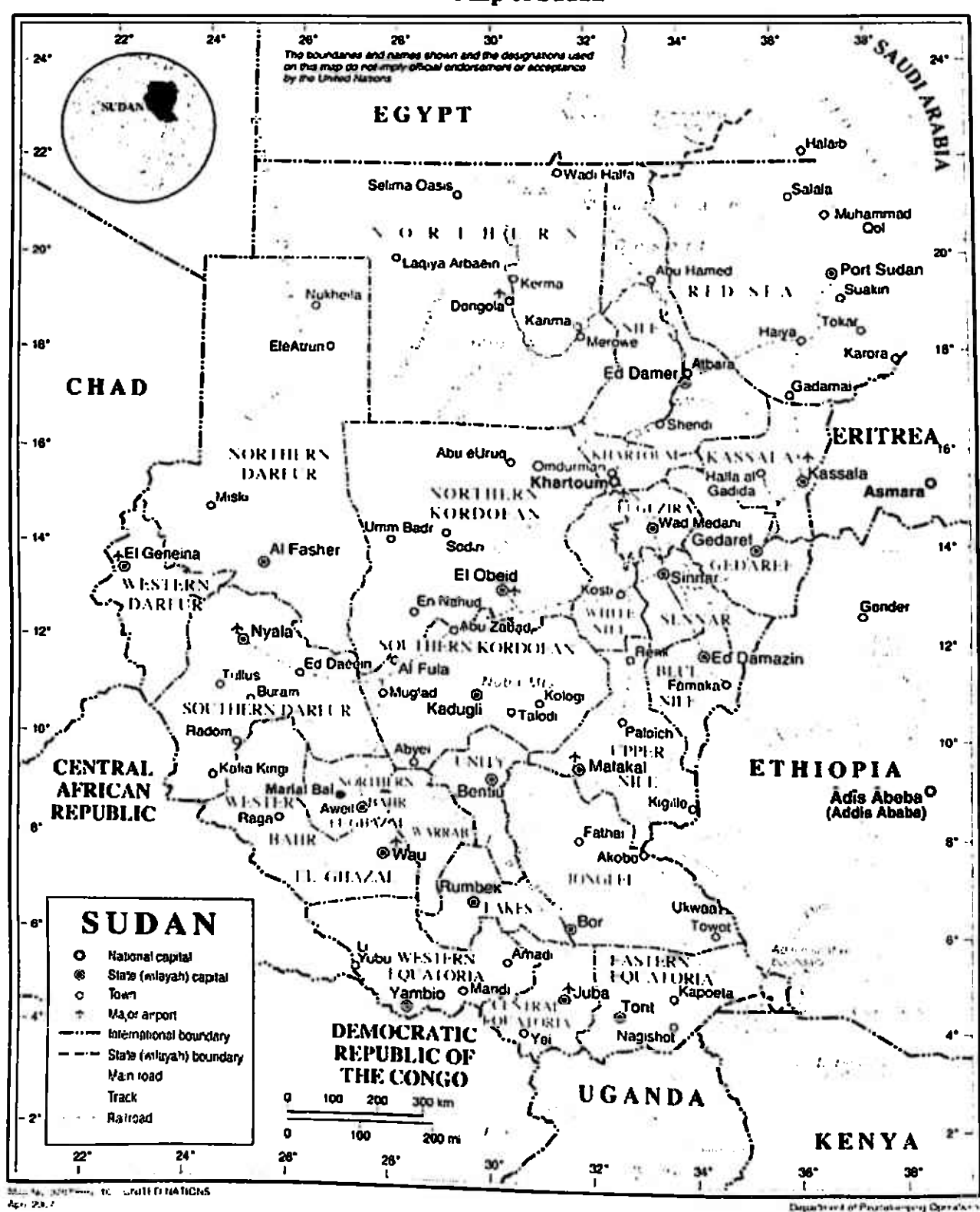
Map 1: Map of Sudan