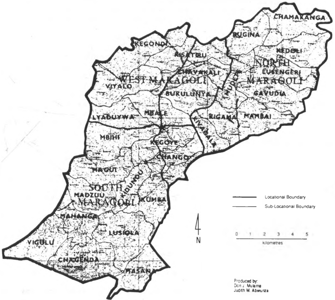
Map 2: Maragoli