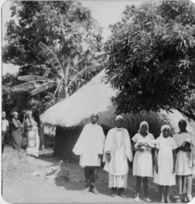
Mother of the child is in the middle. The woman next to her is her helper.