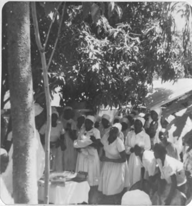
After the service there is rejoicing and dancing, the mother dances - the "Nderu"