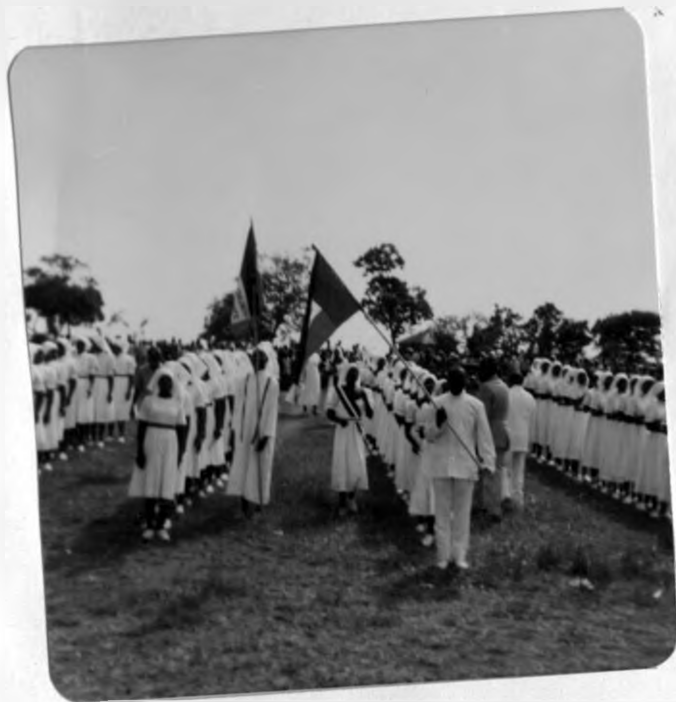
The people have lined up for the competition in neatness.