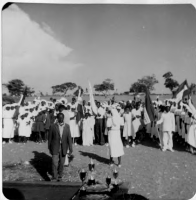
After the competition - people line up to wait for the announcement of the winners and the prize awards.