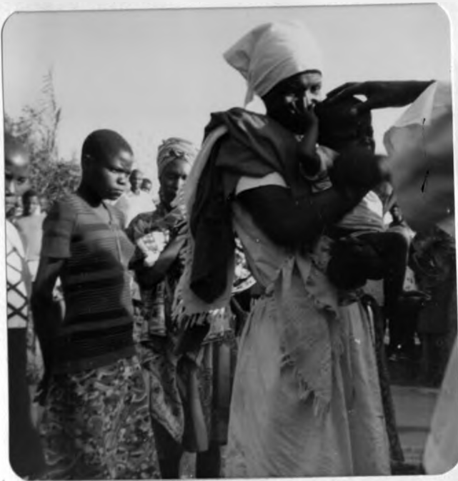
The child is baptised