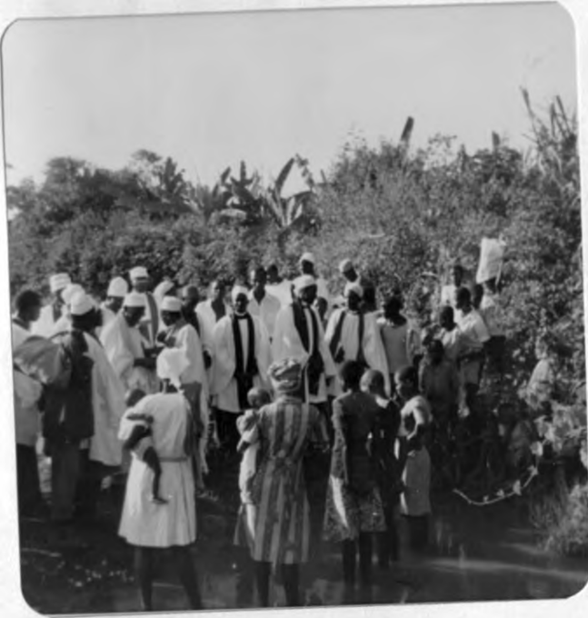
Those to be baptised - standing in the water.