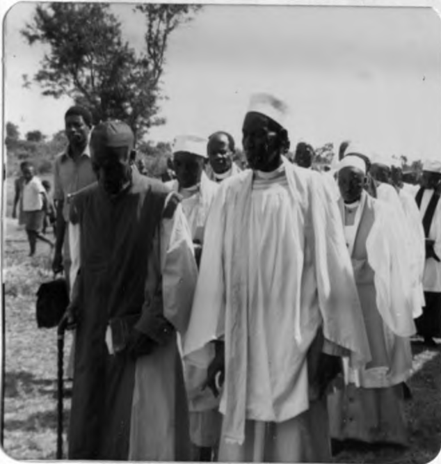
Those who were ordained.