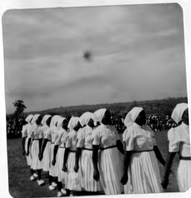
The NLC group from Nairobi (Women).