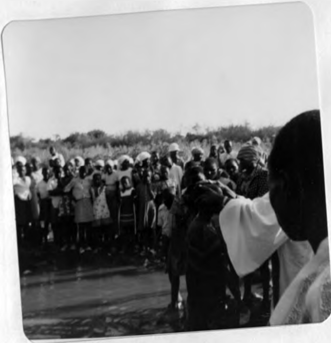
A boy is baptised.