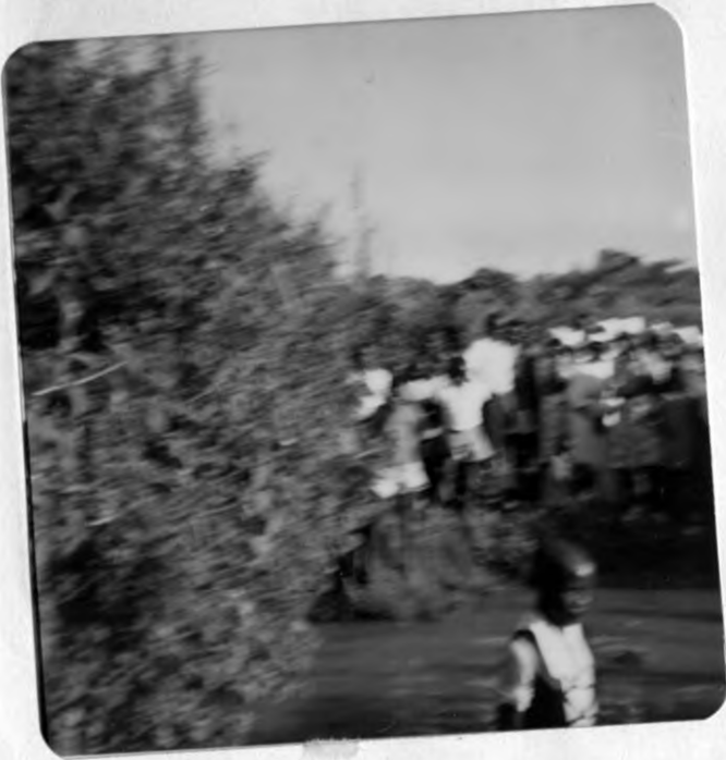
Those already prayed for - immerse themselves in the water.