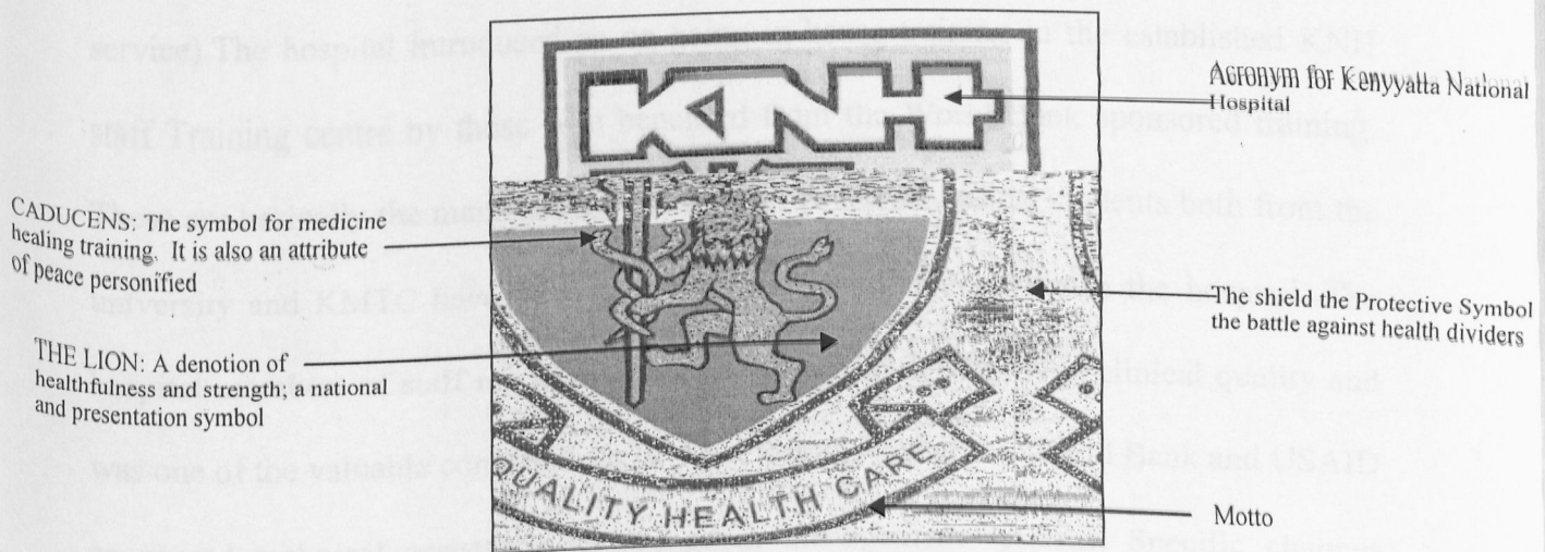
Figure 1.0 : The New Hospital Logo