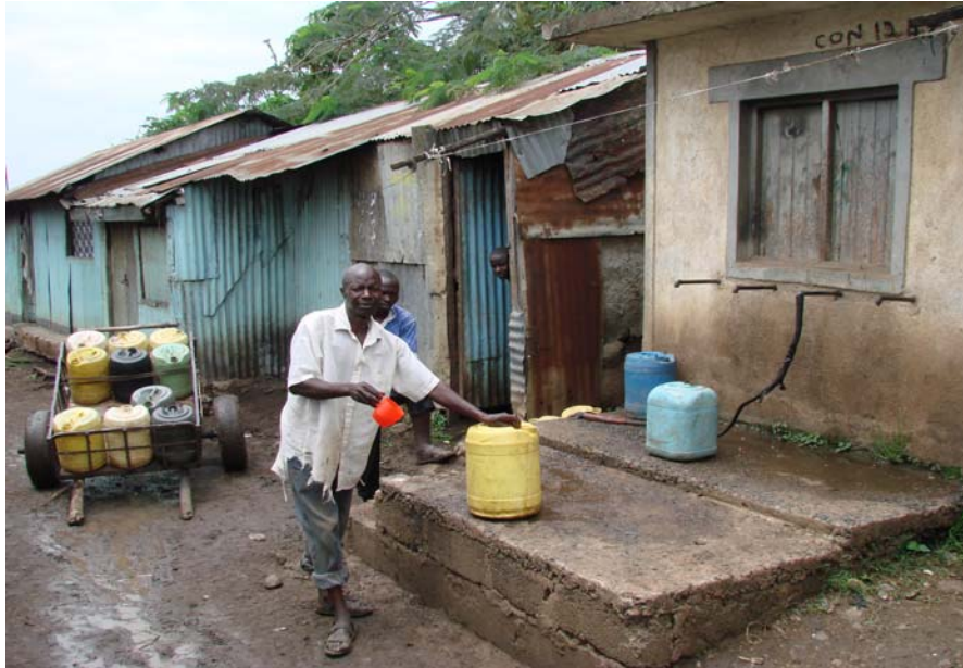
Photo 7 A water vendor gets water from a private water kiosk in Sofia (2011)

Moreover, households relying on private water vendors were just as much – if not more – faced with an unreliable, interrupted and insufficient water supply as people with access to piped water.