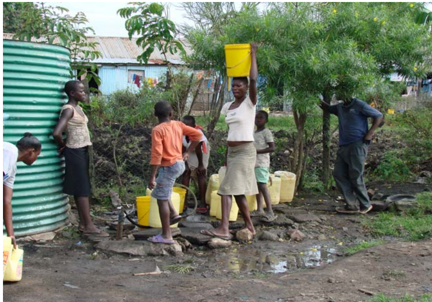
Photo 6 Women fetching water from a private kiosk in Shauri Yako (2011)

Fetching of water is mainly a female task (Photo 6). In the large majority of the households in Sofia and Shauri Yako, it was the female head or the female spouse or a female child who was normally responsible to fetch water (see Annex 1, Table A.4). In quite a number of households, fetching water was a shared responsibility of (at least) two persons; 38 again mostly women, although male children and sometimes the male head were also mentioned. Women and young girls carry a double burden of disadvantage, since they are the ones who sacrifice their time and their education to fetch water (UNDP 2006).