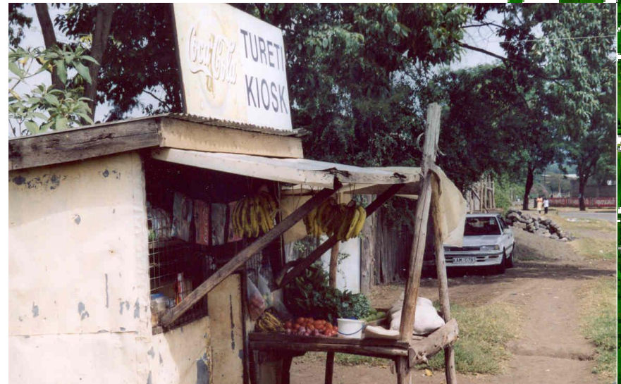
Urban non-farming activities