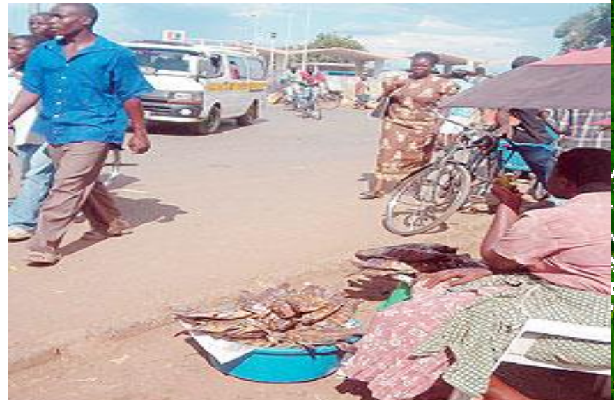
More women in income-generation