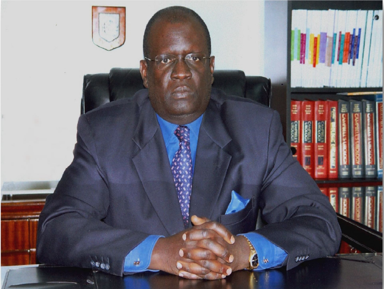
Prof. G. A. O. Magoha, Vice-Chancellor (UON) - Chairman