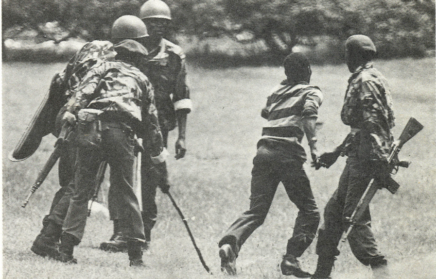
STUDENTS AND POLICE CLASH after students demonstrated in support of greater political freedom on campus.