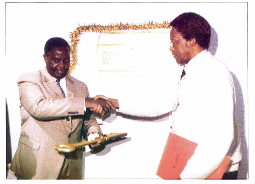
The Minister officially receives the dummy-key for the building from ICIPE Deputy Director General.