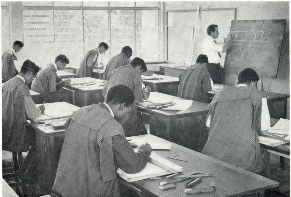
ONE OF THE DRAWING OFFICES