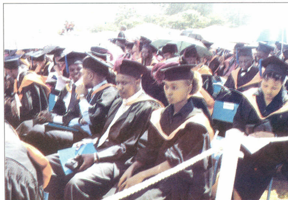
Graduands at the 34th ceremony keenly follow proceedings.