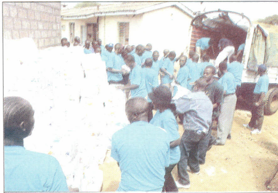
Loading famine relief food for distribution.