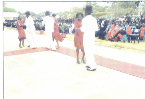
The UoN Salsa Group entertain graduands and guests during 34th graduation ceremony.