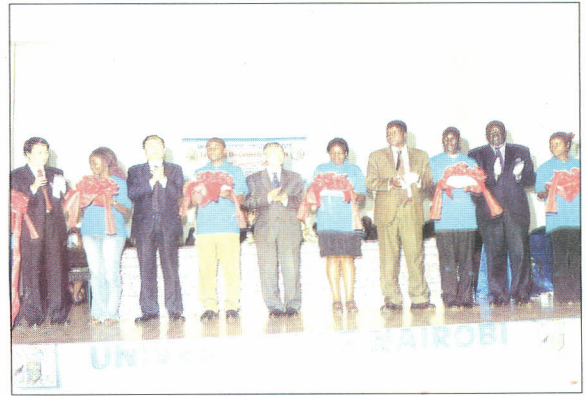
Dignitaries with students during the launch of the Confucius Institute.