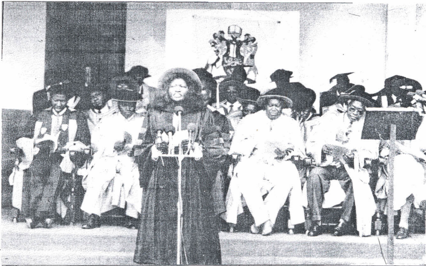
Dons at one of the past graduation ceremonies. Are they getting what their colleagues get elsewhere?