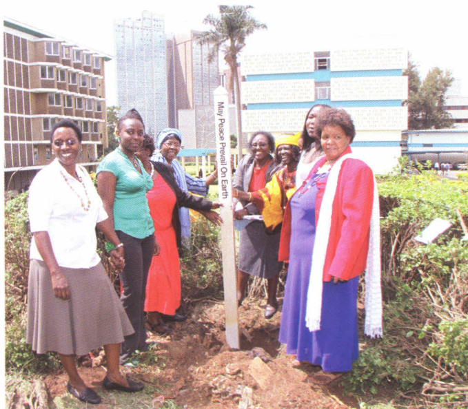
Top women leaders at site of the peace pillar before it was relocated. Above: students relocate the pillar in song and dance.