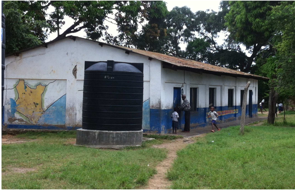
Old dilapidated classrooms at Miritini primary