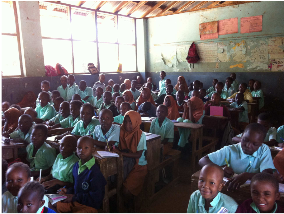
Congested classroom at Mtopanga primary school