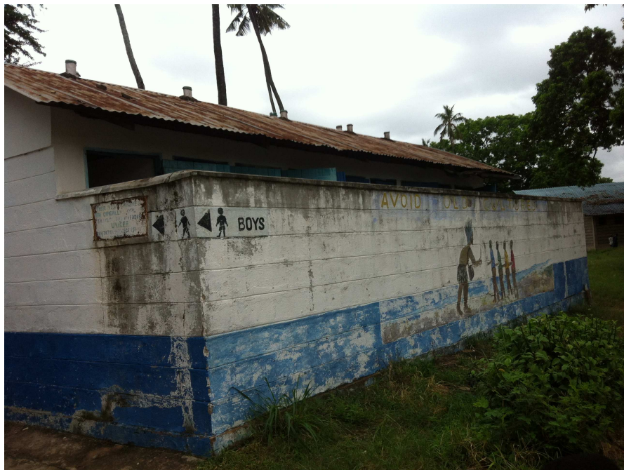
Old dilapidated toilets at Miritini primary school