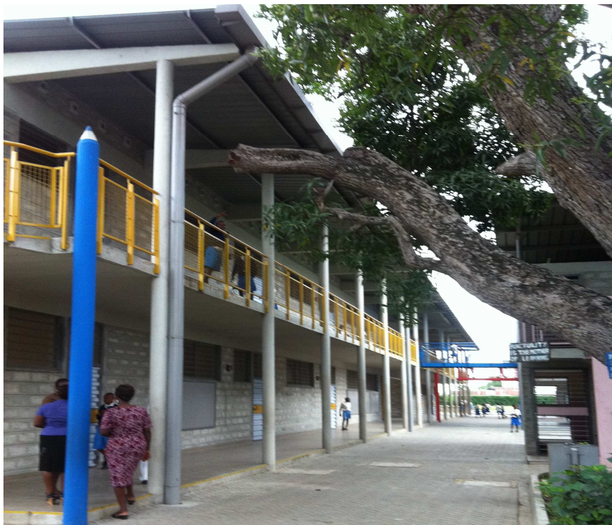
Modern classrooms at Mikindani primary school built by sponsors