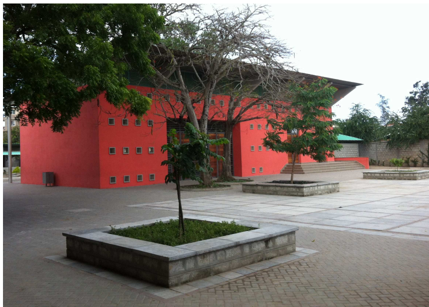
Modern toilet facilities at Mikindani primary school built by sponsors