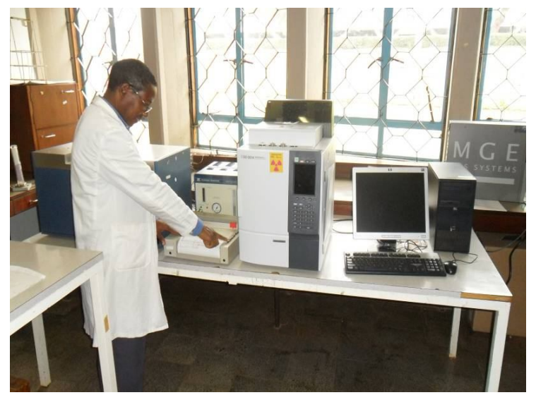
Technologist in the GC room where pesticide residue analysis takes place.