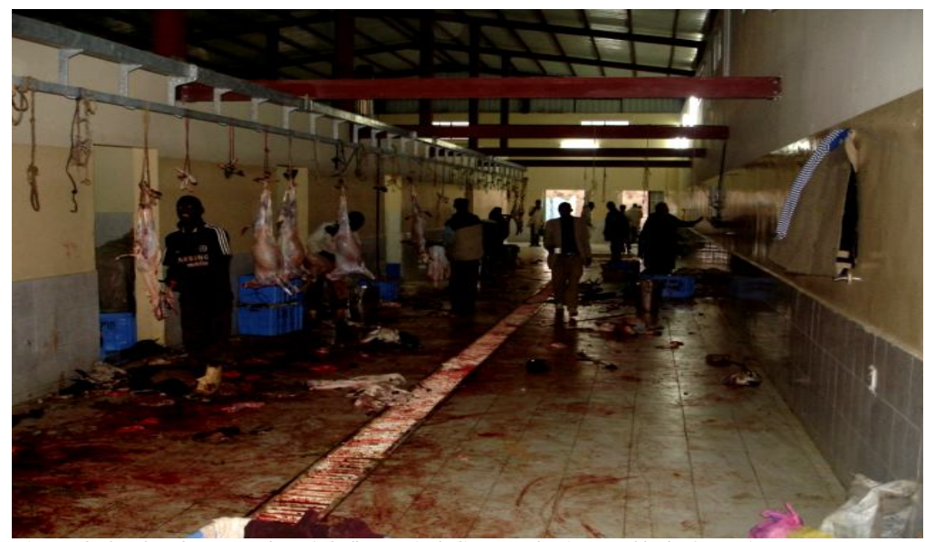
Livestock slaughter has a number of challenges including poor hygiene and lack of meat inspectors