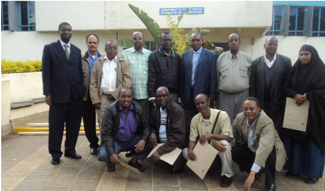
University of Nairobi lecturers with the six trainees from Mogadishu, Somalia at the end of the training period in the Department of Public Health, Pharmacology and Toxicology.