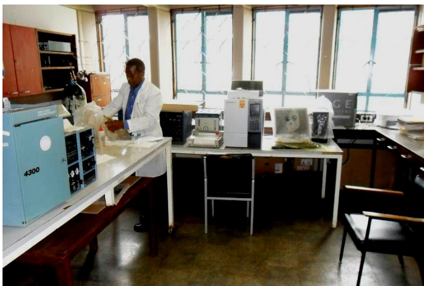
A technologist analyzing pesticide residues using Gas Chromatography

The results obtained showed that all the samples contained arsenic at levels ranging from 0.007 to 0.099 ppm, while the levels of lead ranged from 0.072 to 0.449 ppm. The pesticides detected in the milk samples were heptachlor epoxide, aldrin, 2'4'DDT, 4'4'DDT 4'4'DDD, endrin, deltamethrin and cypermethrin in 7%, 20%, 7%, 13%, 40%, 7%, 73% and 87% of samples respectively. None of the samples analysed contained quantifiable levels of veterinary drug residues at the detection limit of 1ppm. The samples were also not found to contain detectable levels of aflatoxin M 1 at detection limit of 5 ppt. The results of the study indicated that sample had levels above the recommended maximum residue limits (MRL) and acceptable daily intakes (ADIs).