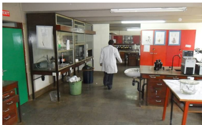
C. Pharmacology and Toxicology Laboratory