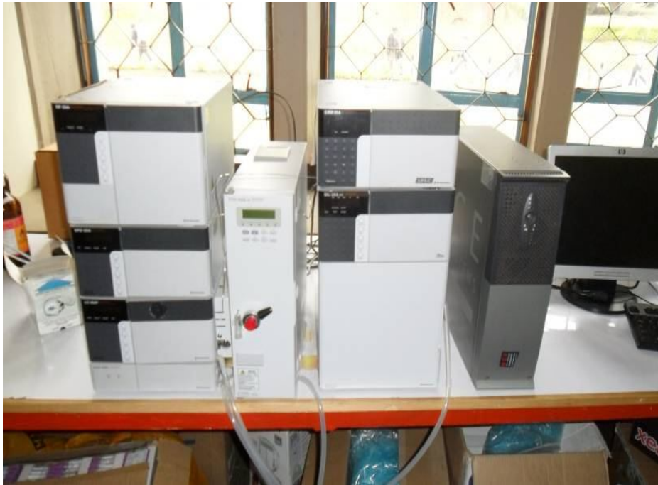
HPLC for analysis of drug residues and mycotoxins in the Department of Public Health, Pharmacology