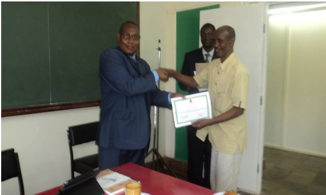
Dean, Faculty of Veterinary Medicine presenting a Certificate of Participation to one of the trainees at the end of the training.