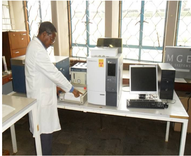
Technologist in the GC room where pesticide residue analysis takes place.