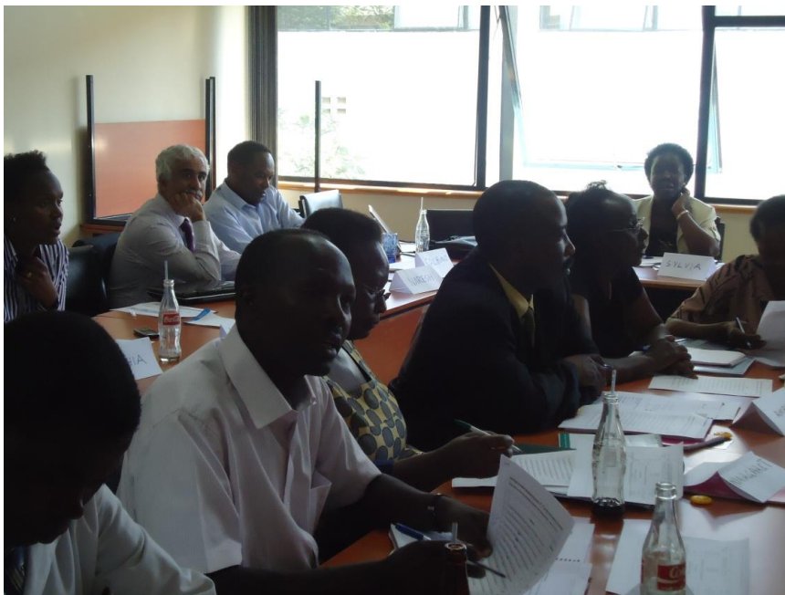
Fig 1: Participants in the Medical Education Course