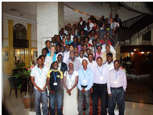
Fig 2 – Participants in Paediatric HIV course

A certificate of participation in the course was issued by Tr@inforPedHIV. CME credits were provided as required.