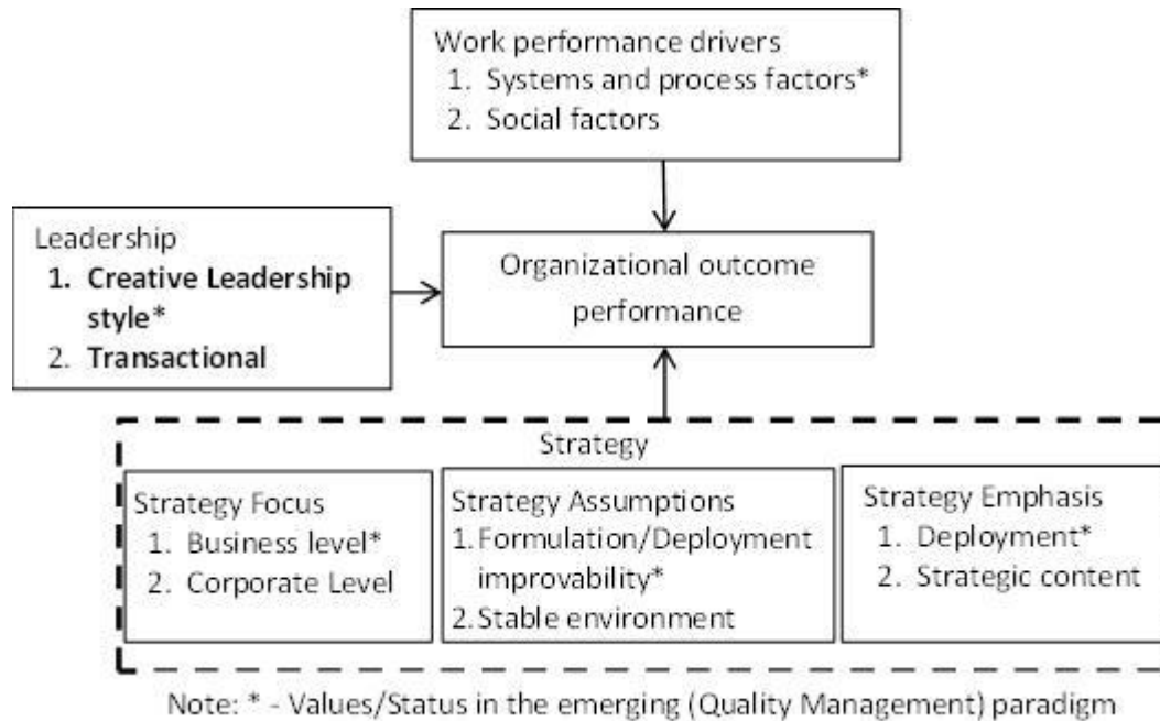
Figure 2. A model of Organizational Systems based on the emerging management paradigm.