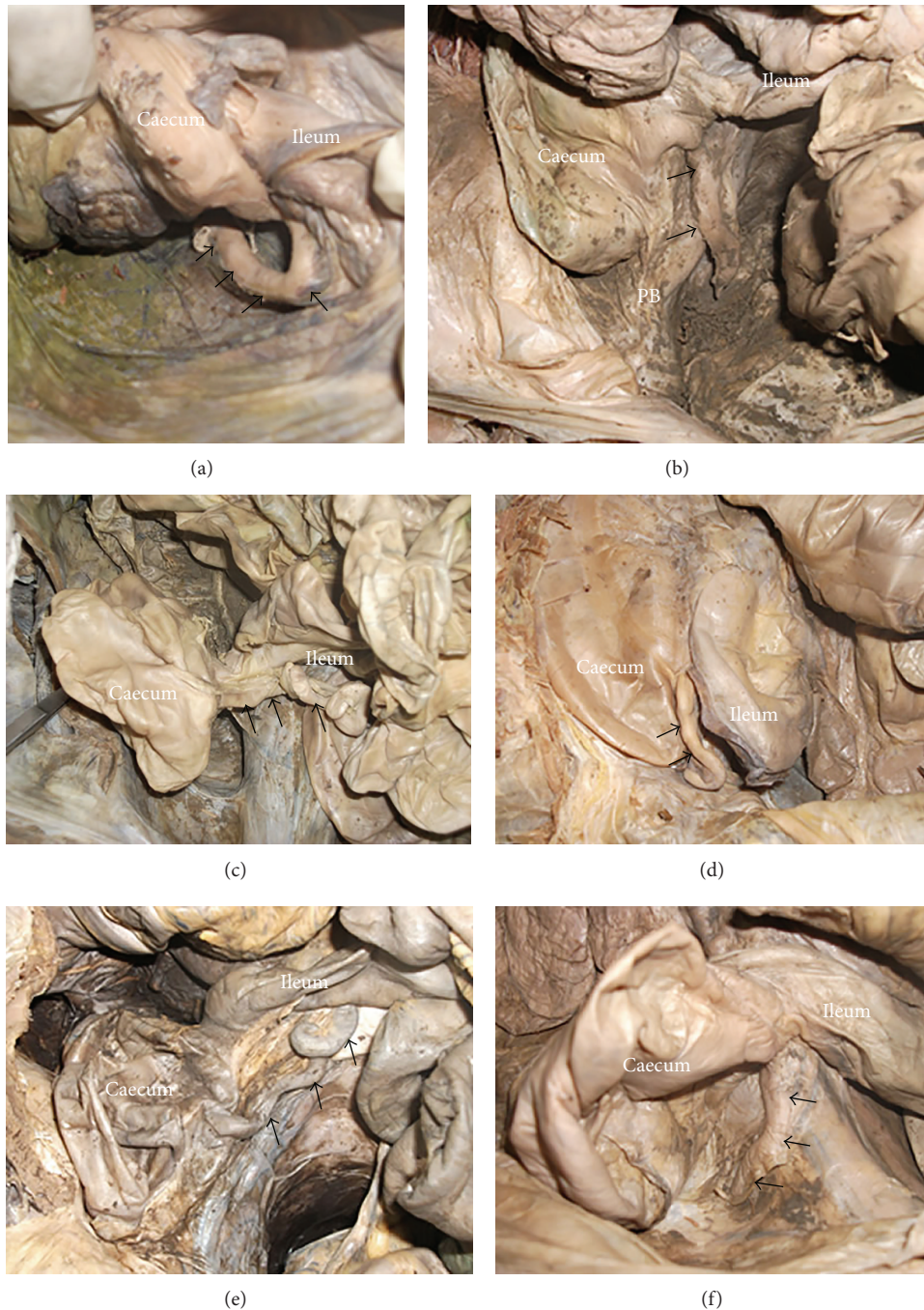
FIGURE 2: Position of the appendix (arrow). (a) Retrocecal appendix (note the appendix curving behind the caecum). (b) Pelvic appendix (note the appendix crossing the pelvic brim (PB)). (c) Preileal appendix. (d) Subileal appendix. (e) Postileal appendix. (f) Subcecal appendix.

surgeons need to be aware of this variation for preoperative planning and better surgical outcomes. Current results postulate that trainee surgeons should not be surprised if the appendix is not easily visualized when a transverse incision is made at the McBurney's point.