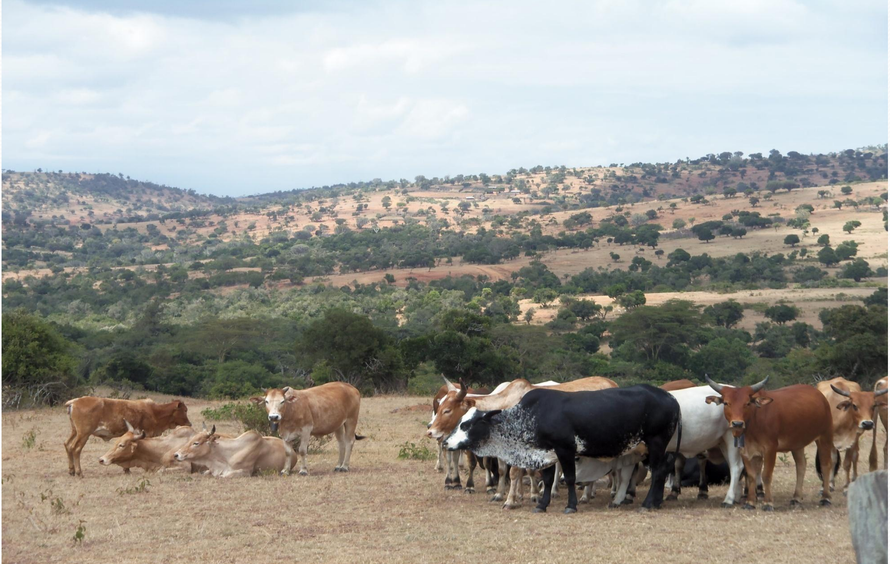
Plate 3: