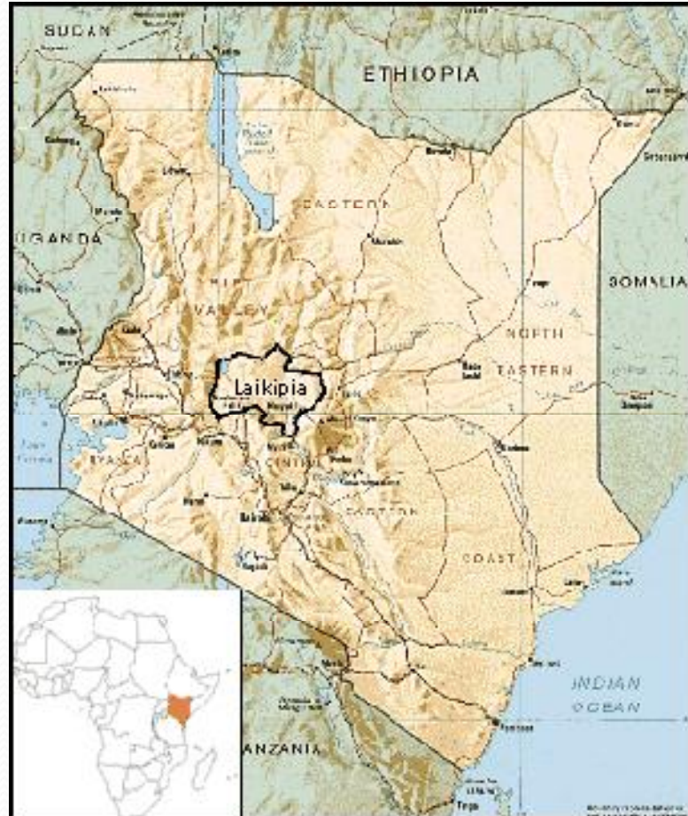
Fig 1: Study area- Laikipia County, Kenya