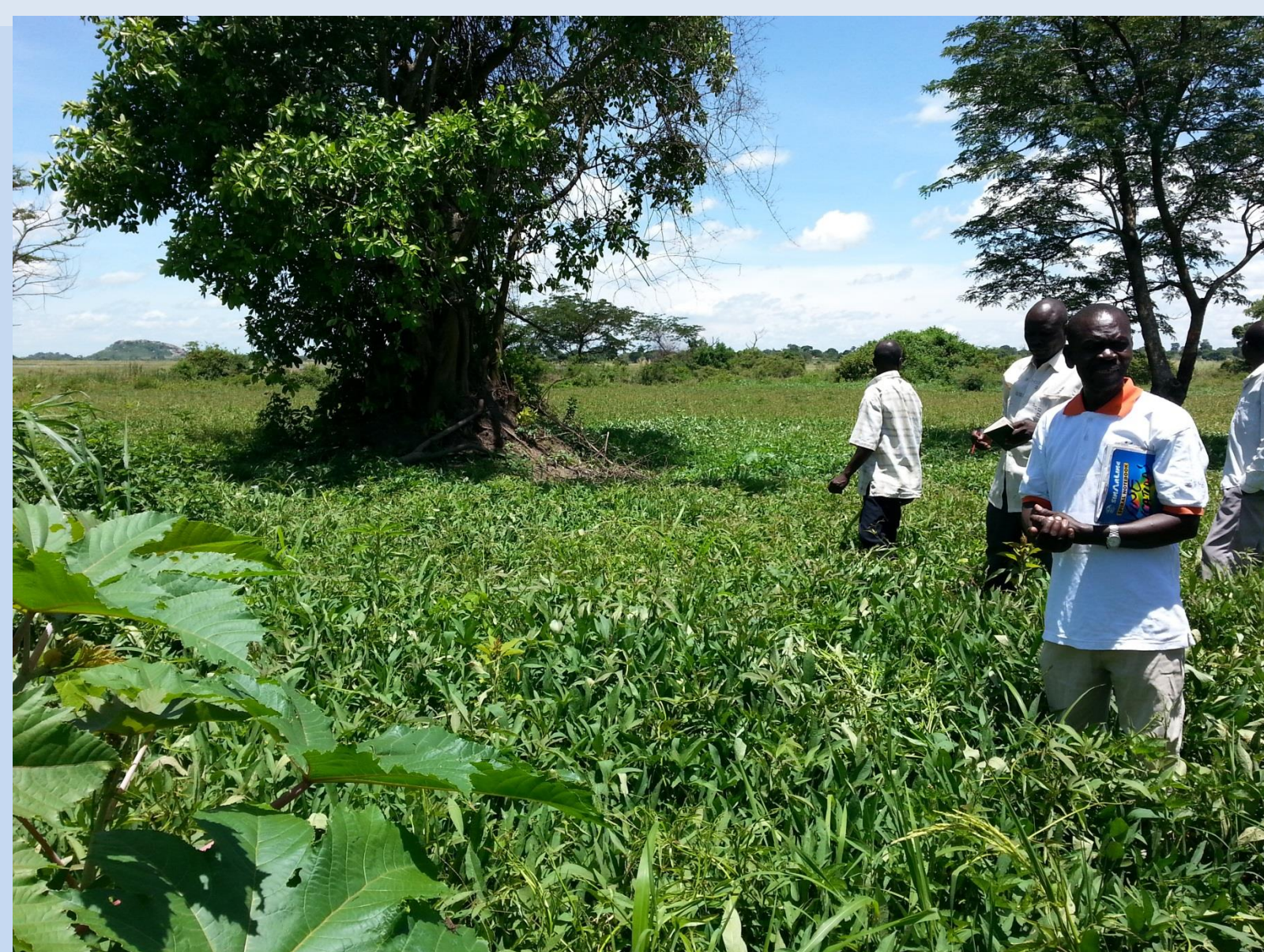
A DVM showing his crop