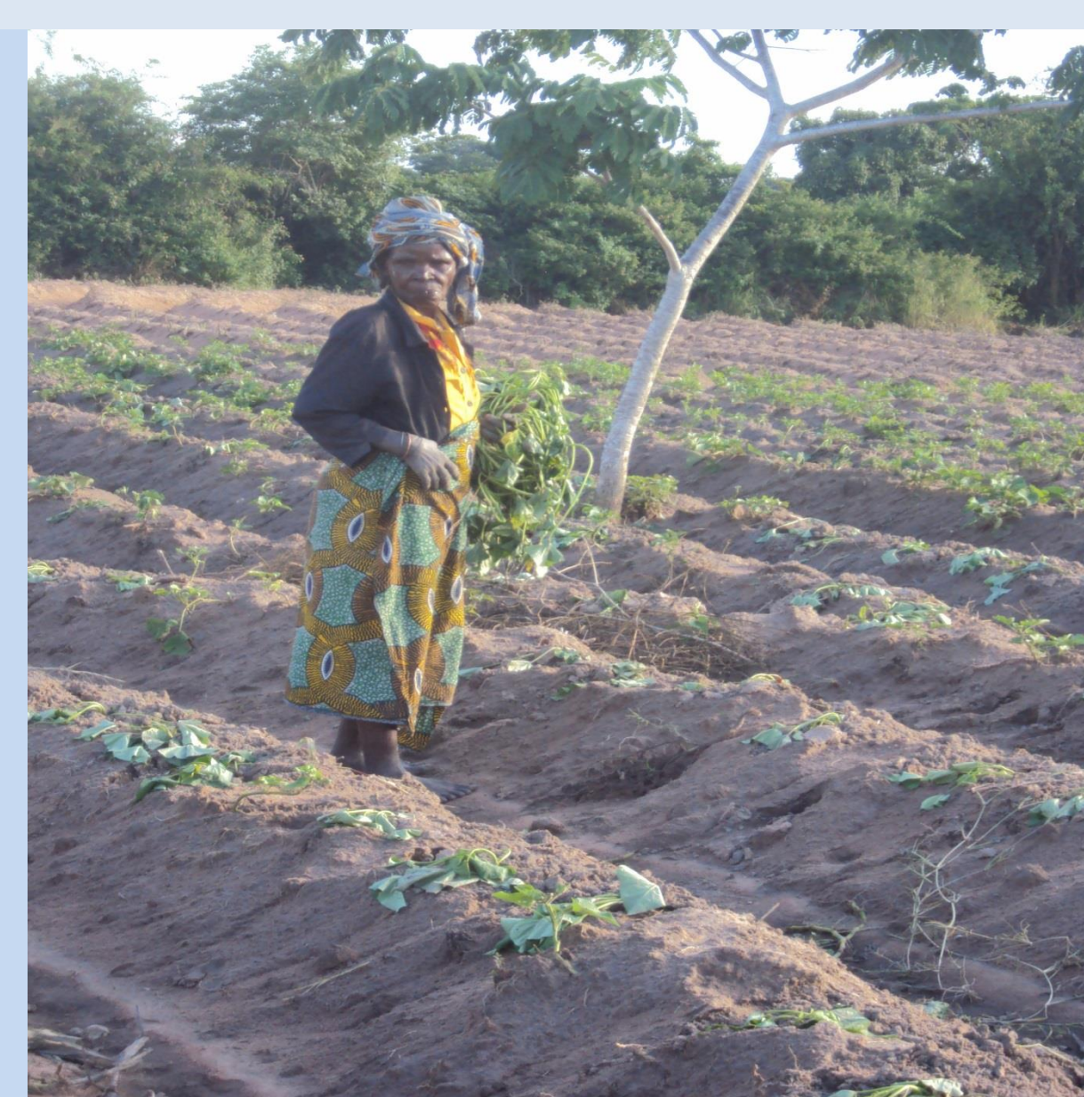
Farmer planting OFSP