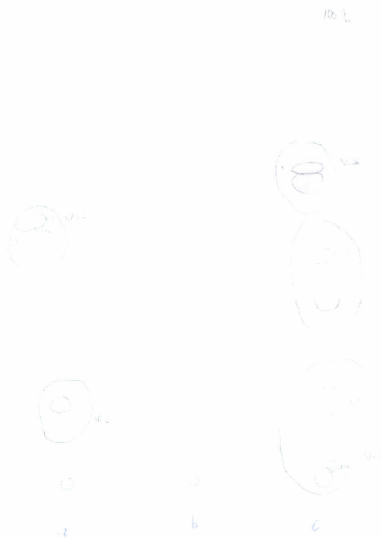
Fig 1.5 TLC of chloroform extracts using 100% chloroform as mobile phase