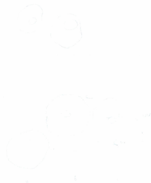
Fig 1.6 TLC chromatogram of methanol extracts using chloroform to methanol (95:5) mobile solvent