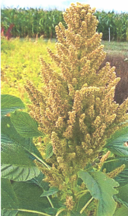
Fig 1.3Amaranth leaf and grain