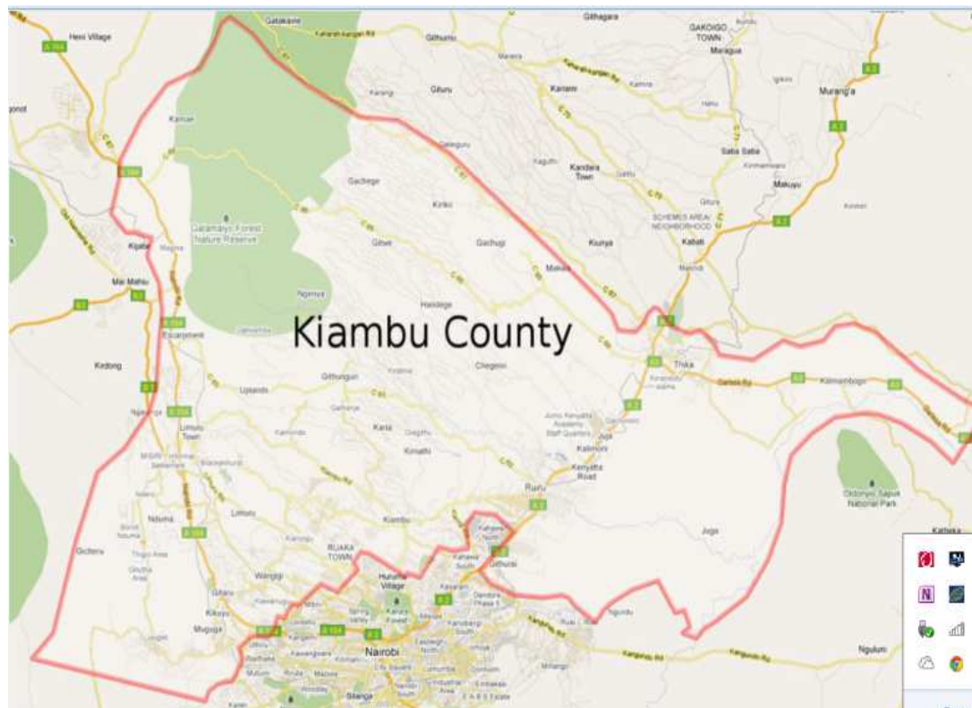
Figure 3.1 Map of Kiambu County

The study was carried out within the political boundaries of Thika Sub-County in Kiambu County covering an area of 216.72 square kilometers where there are 11 special schools and units that cater for both boys and girls and enrolled children with special needs from all over the country.