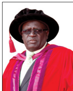
Vice-Chancellor Prof. George A.O. Magoha, EBS., MBBS, (Lagos), FRCS, FWACS, FICS, FCS, (ECSA), MISC, MKNAS, FAAS, FMCS, (Urol)