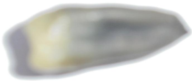
Figure 3: Canal configuration type II in second permanent mandibular molar.

Vertucci's classification (1984) 1 was applied in analyzing the root canal configuration.