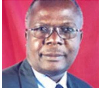
Deputy Vice-Chancellor (Academic) University of Nairobi