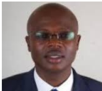
Principal- Kenya Utalii College