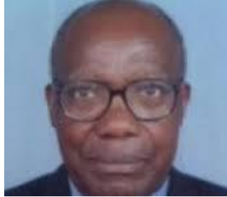
Chancellor, Kisii University