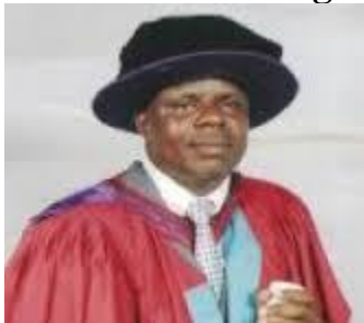
Chairman, Multi-Media University Council