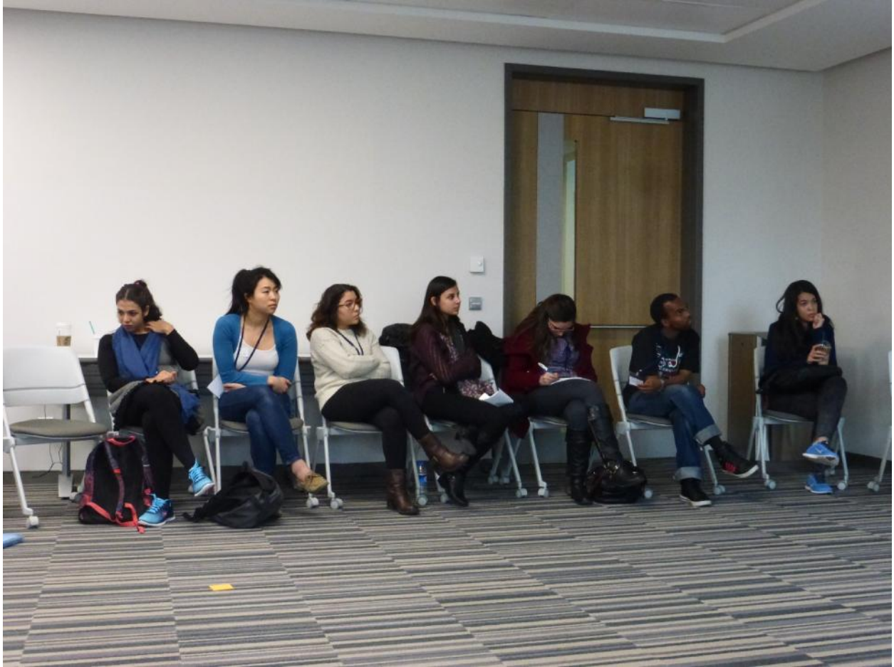
Figure 6: Various countries represented, Kazakhstan, Canada, Lebanon, Tunisia and Kenya