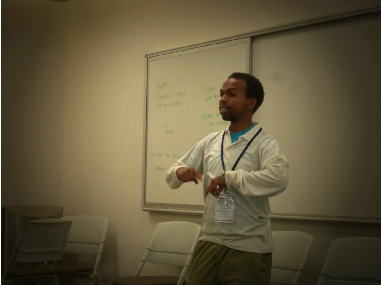
Figure 11: Illustrating a point to the rest of the group during my presentation in the session