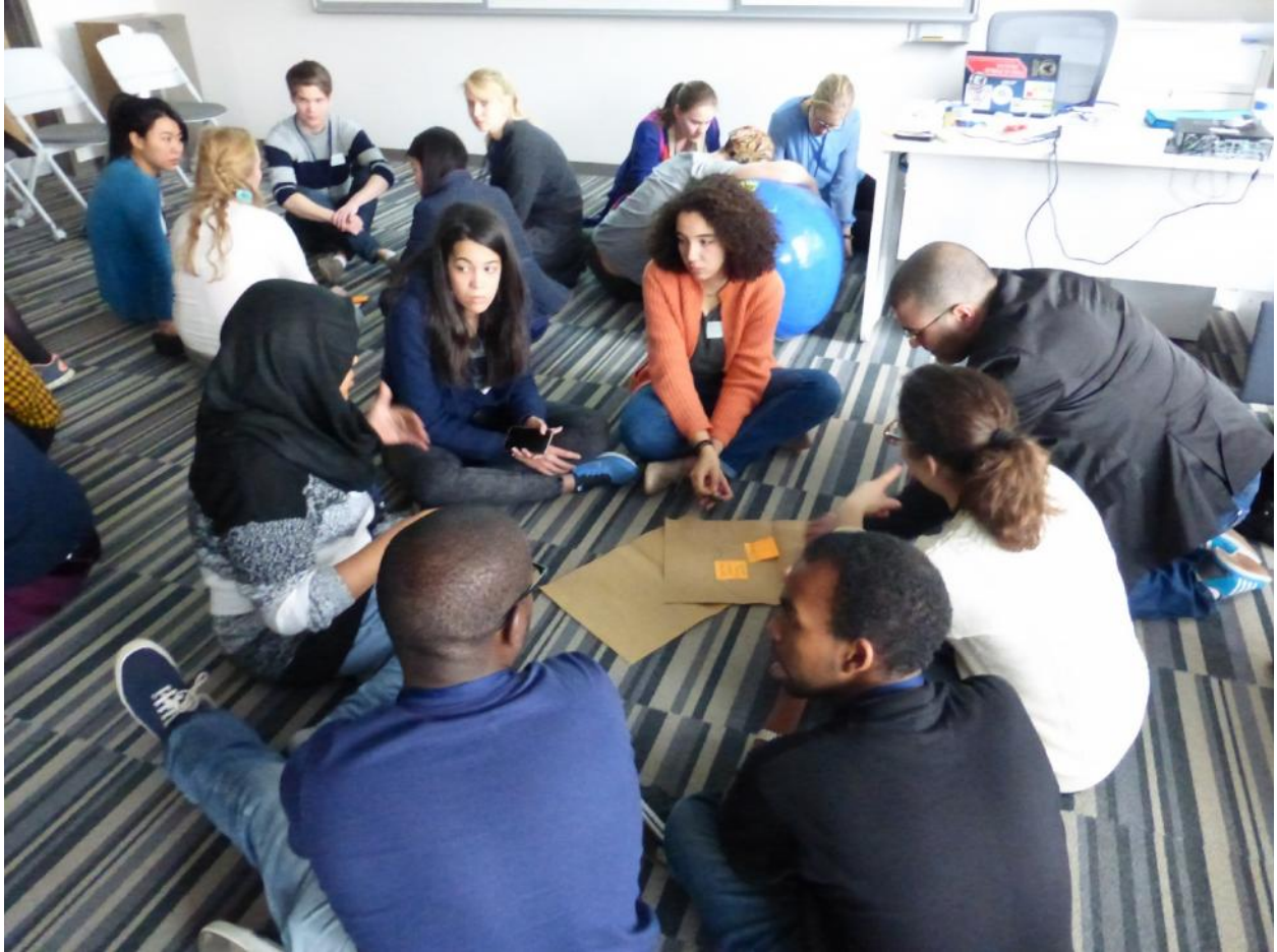
Figure 4: Small working groups during the sessions