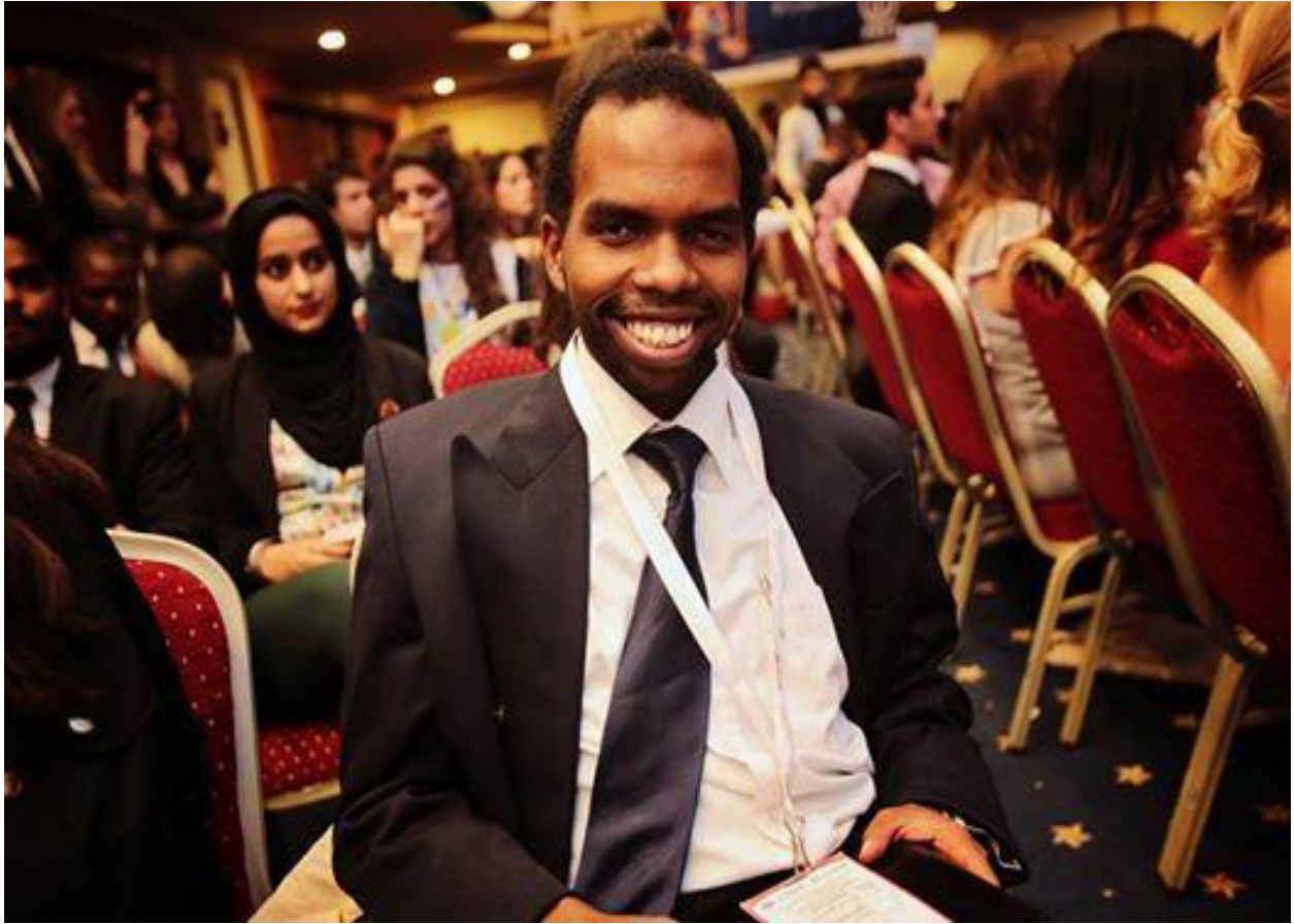
Figure 2: The opening ceremony of the General Assembly