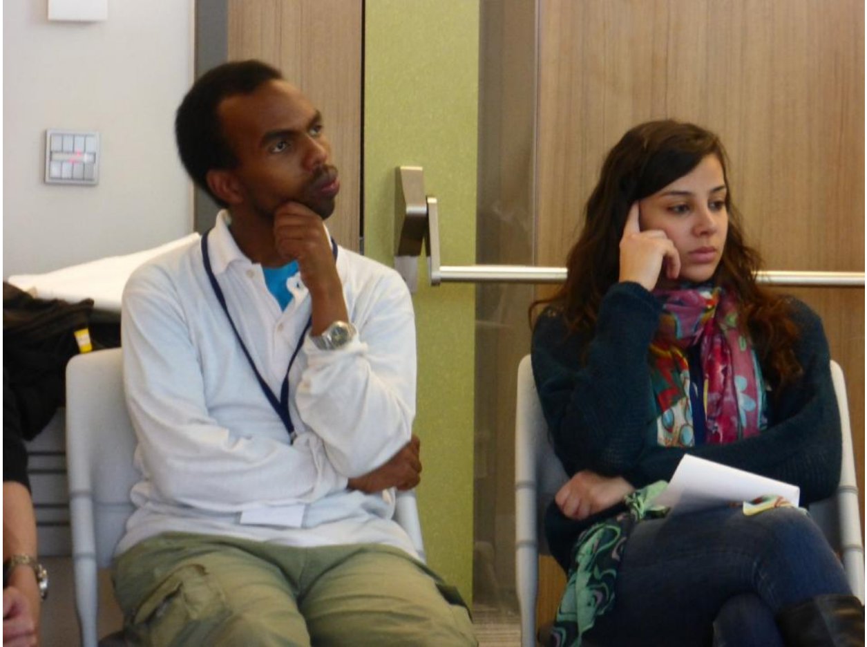
Figure 9: Focusing on the session that was ongoing