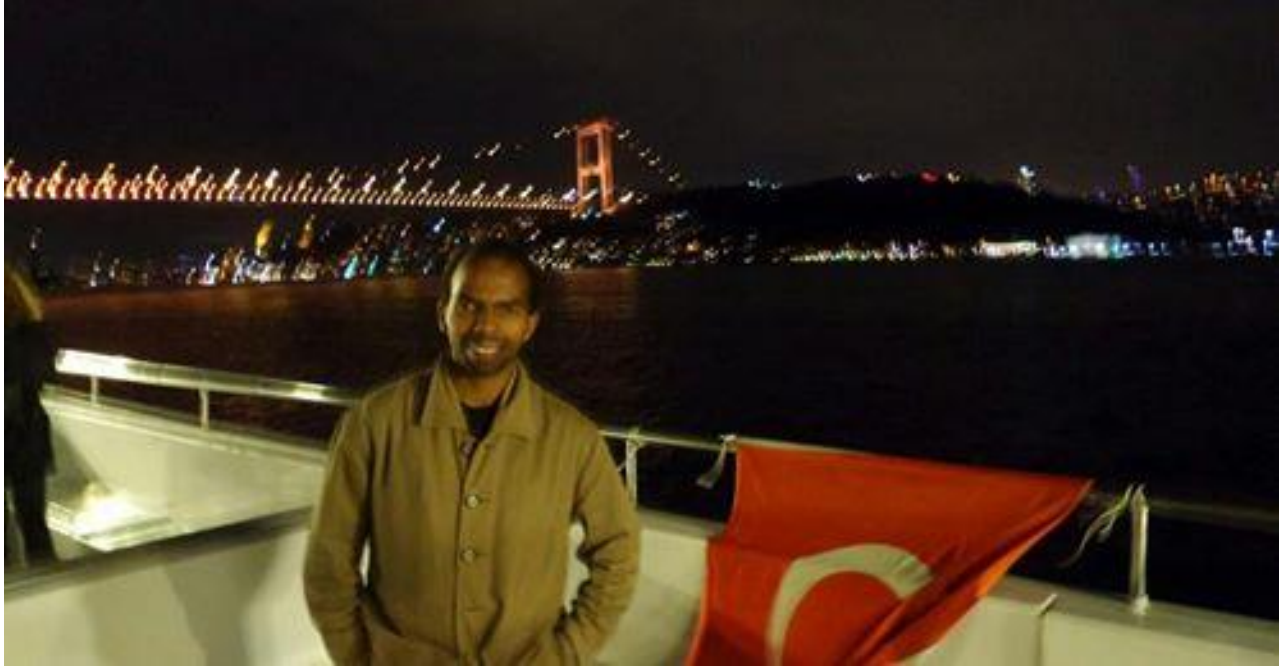
Figure 10: Social program, gone down for a cruise to the Bosphorus Strait at Istanbul