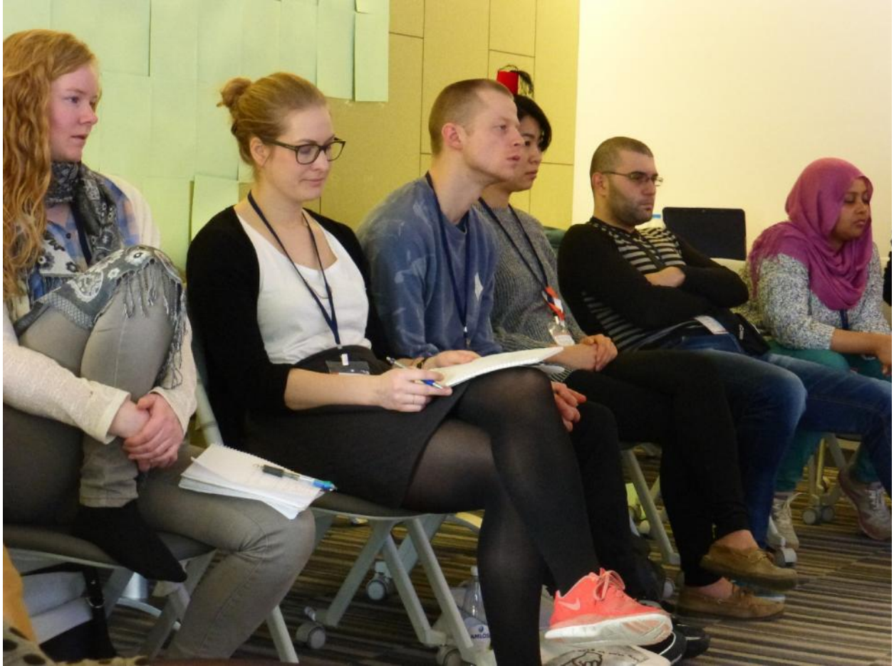
Figure 8: Discussions on going during one of the sessions; Represented countries; Norway, Denmark, Canada, Algeria and Sudan