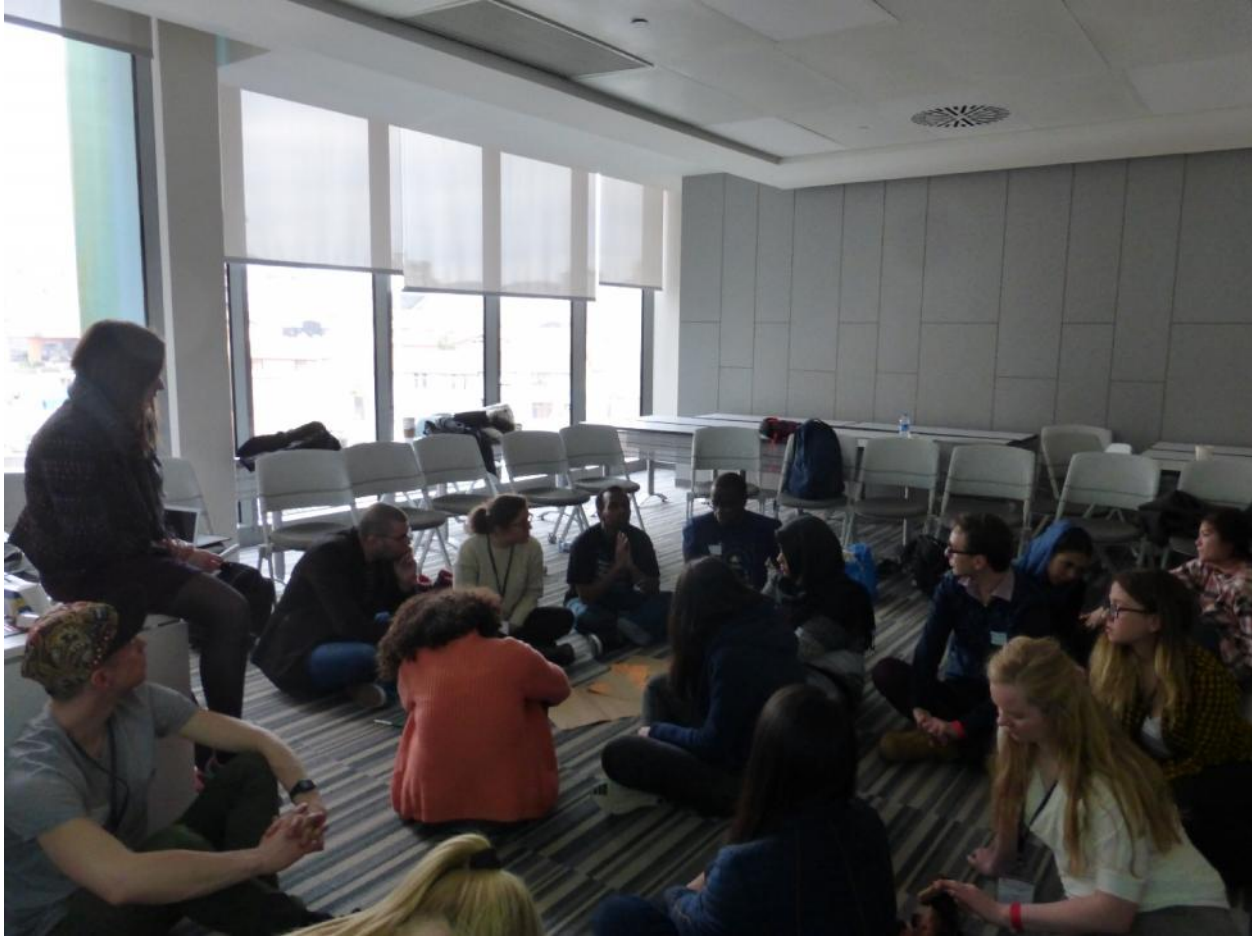
Figure 5: Discussions during the various sessions