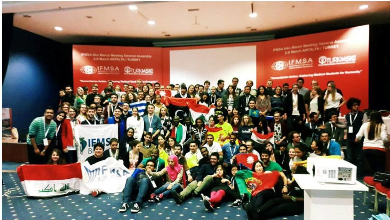
Figure 1: A representation of all the countries that attended the President's sessions