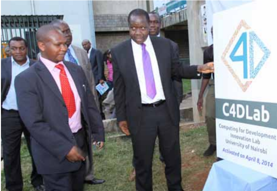
Cabinet Secretary for information, Communication and Technology, Dr. Fred Matiang'i launch the CD4 lab at the School of Computing and Informatics.

THE C4D LAB IS FOCUSING ON TECHNOLOGY INCUBATION AND PROTOTYPE DEVELOPMENT