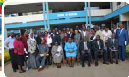
Inset: University of Nairobi members of staff and EALA Members at the College of Health Sciences.