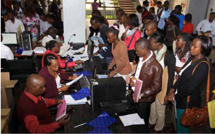
First year students register at the Main Campus.