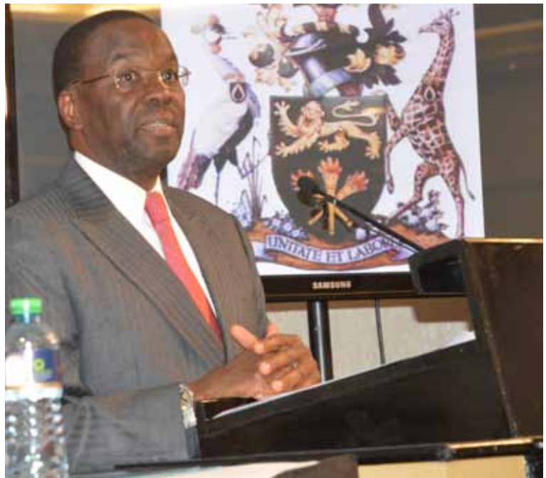
Dr. Willy Mutunga , Chief Justice.