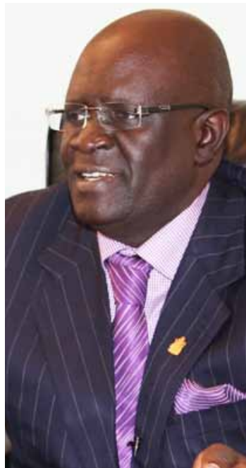
Prof. George A.O. Magoha , Vice-Chancellor

"I WOULD LIKE TO COMMEND THE GOVERNMENT MOST SINCERELY FOR CONTINUING TO SUPPORT OUR SEED FOR QUALITY AMIDST DEMANDING RESOURCES"