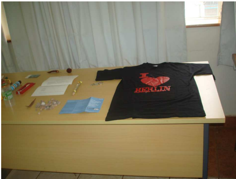
Items on display during the exhibition