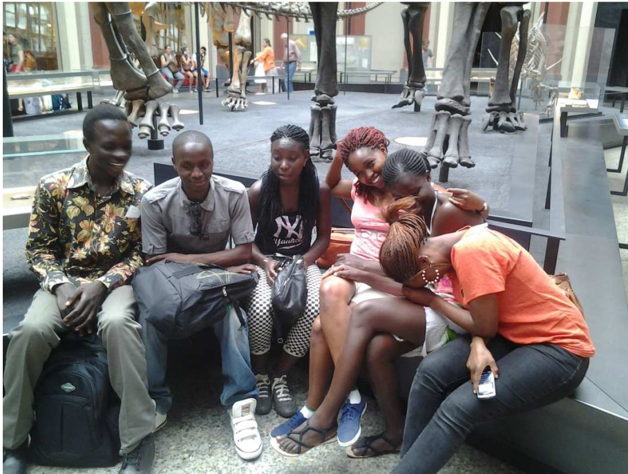
The students visit the Natural Museum