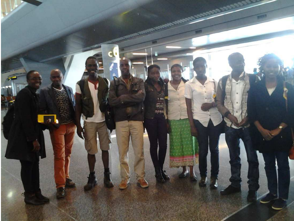
Kenyan student and staff in Doha enroute to Berlin

There were discussions on the possibilities of postgraduate education (practicals, doctoral, MSc theses) and of scholarships through the DAAD or other organisations.