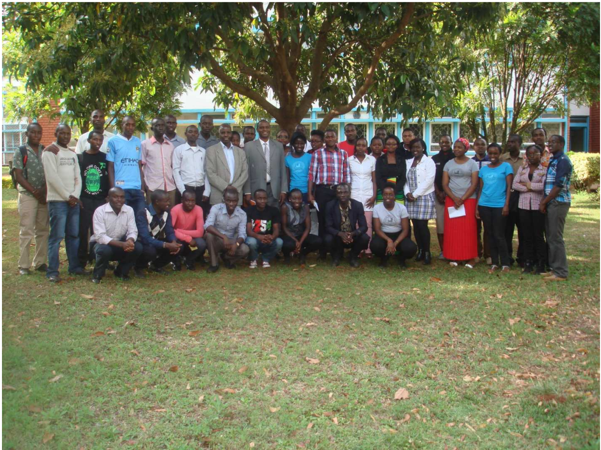
Group photo of students and staff who attended the exhibition on 15-10-2014 at CSD Seminar Room Kabete