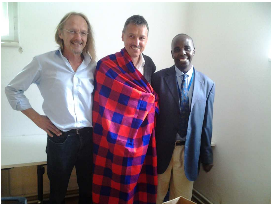
The Dean of Free University of Berlin is presented with a shuka by the students