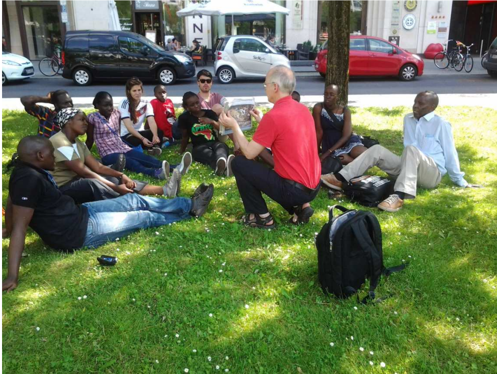
A history lesson on the East and West Germany