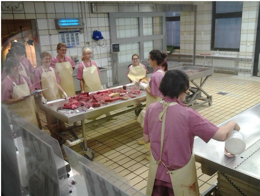
The students observe a post mortem