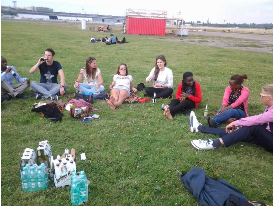
The students have quality time in Berlin