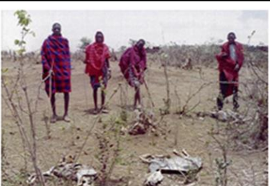
Figure 1: Impacts of climate extremes associated with floods (L) and drought (R) in parts of GHA

Although there has been significant improvement in the science and technology related to climate, most of the early warning strategies piloted in African countries are developed and applied without inputs from the vulnerable local communities, including their local knowledge, needs, and priorities. This often leads to non-use of the available early warning products.