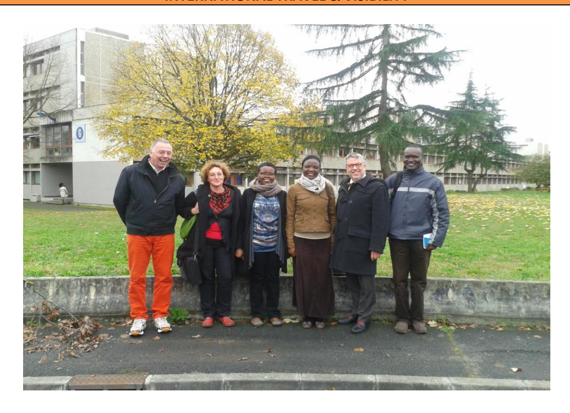
In 2014, the following staff members were involved in academic-related international travels