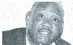
Governor Samuel Tunai

A monthly management report indicates that KAPS collected Sh1.3 billion to the county government in the six months under review, a significant improvement from the Sh1 billion collected in the same.