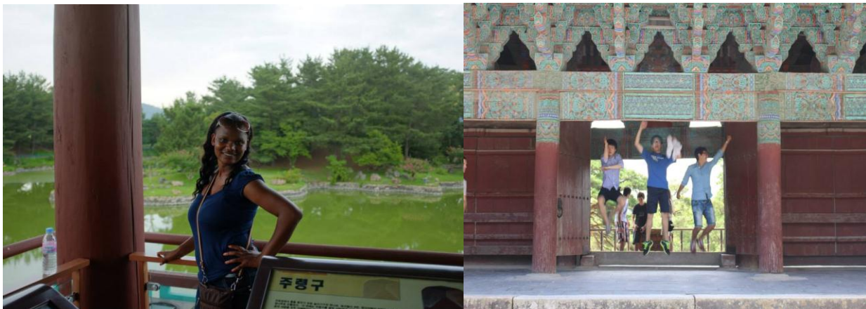
Phoebe at Gyeongju

Exploring Gyeongju ( Cheonmachomg Tomb etc.)