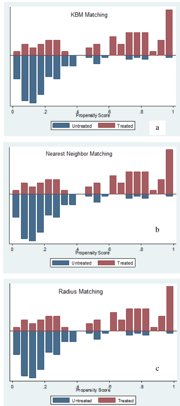
Fig. 1 Distribution of propensity scores on region of common support using (a) KBM, (b) nearest neighbour and (c) radius matching.

non organic vegetable farmers was almost similar in all the three matching algorithms as expected. Most of the individuals practicing organic production system were within the region of common support and could therefore find a suitable match of non organic