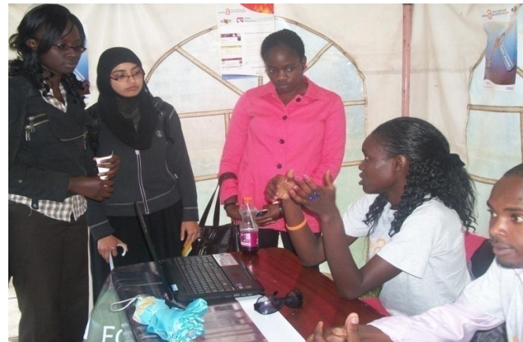
Egerton University Chapter