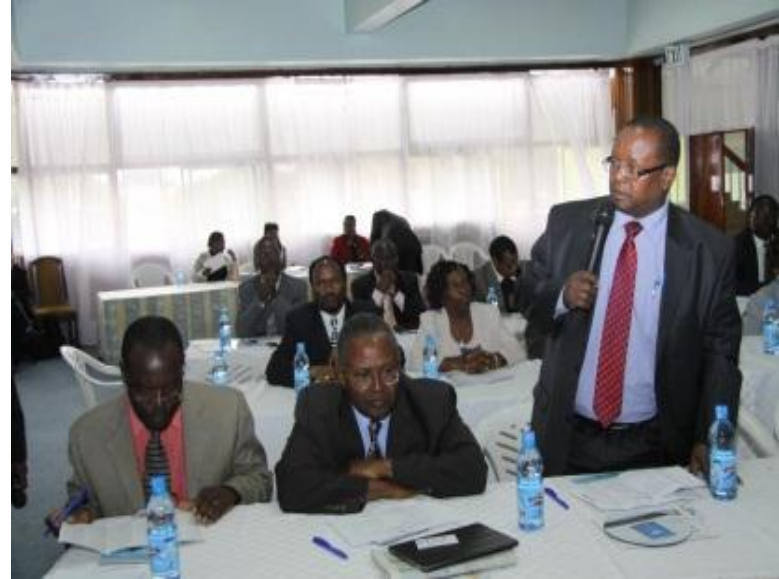
OA/IR Workshop, Aug 2012