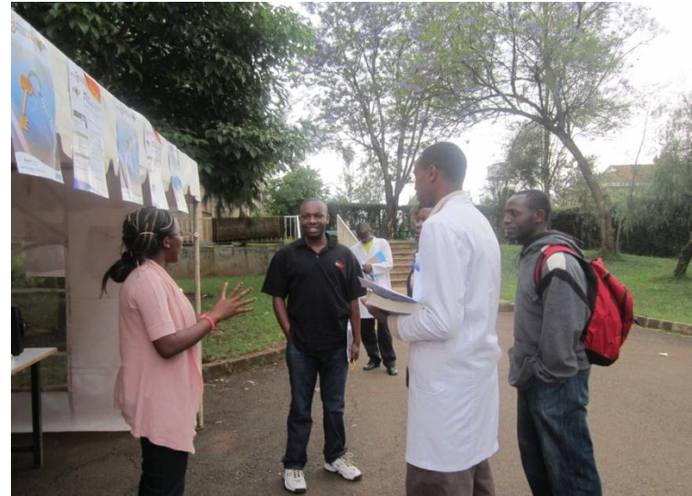
Moi University Chapter