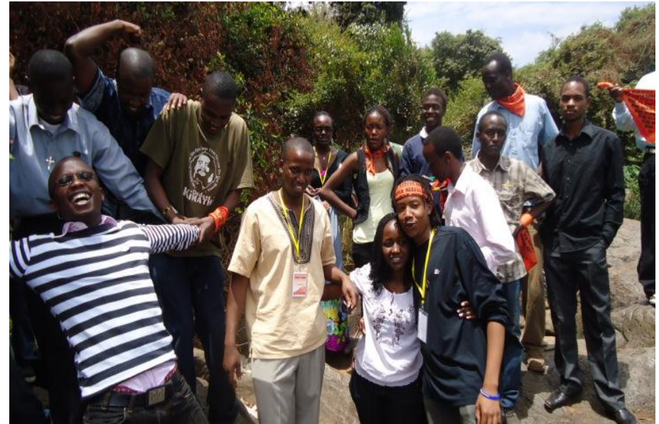
Jomo Kenyatta University Fashion Show