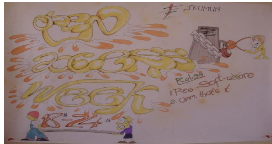
Jomo Kenyatta University Artwork