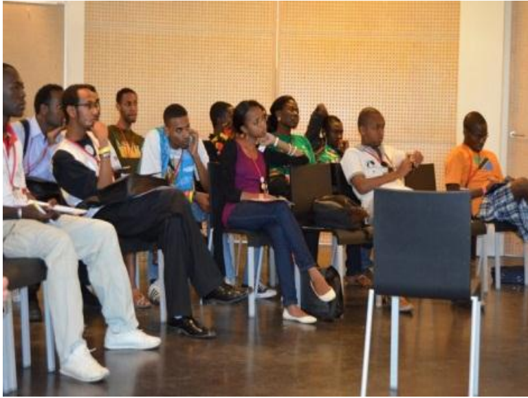
IFMSA Meeting, August 2011