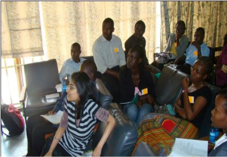
Joint OA Training