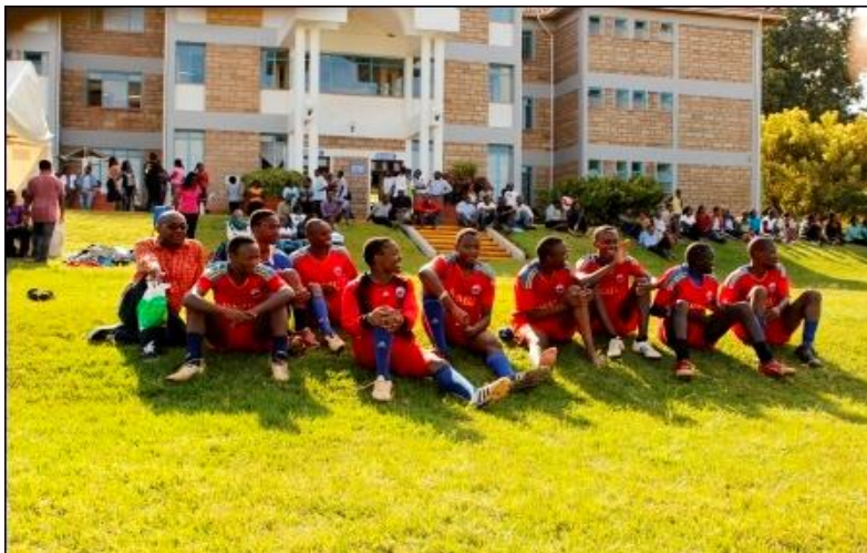
Methodist University Students