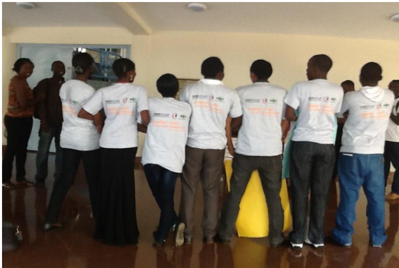
Kenyatta University Chapter