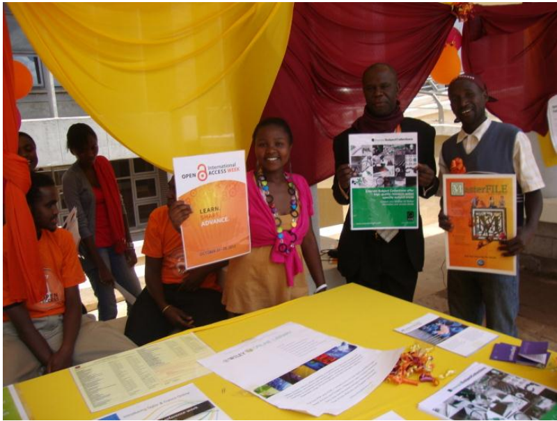
Catholic University Students