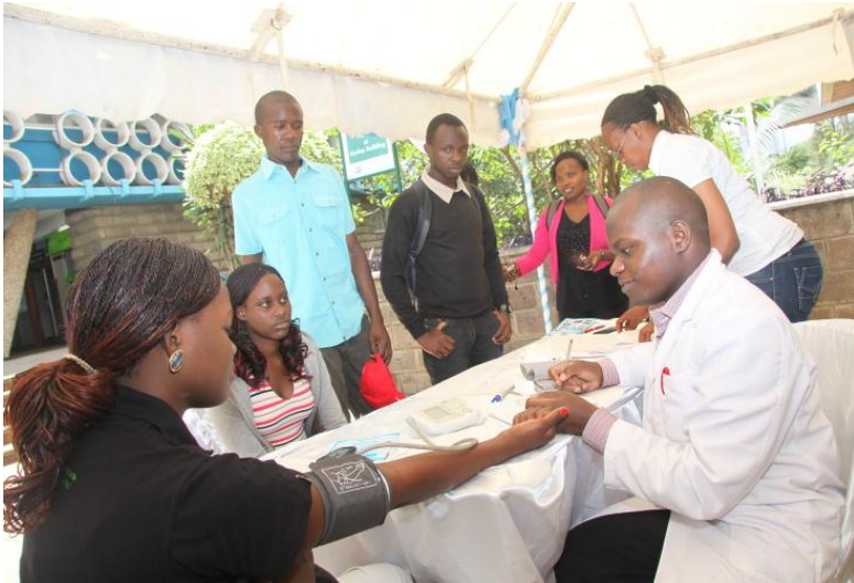
Free Medical Screening, 2012