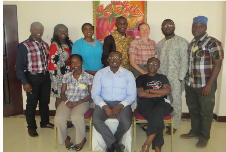
IPPNW Meeting, October, 2013