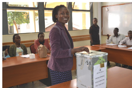
ONUSS students practicing their democratic rights