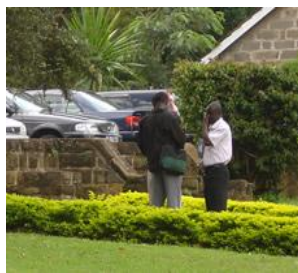
Students interacting at Chiromo campus

It is often whispered in high schools across the country that life at the University is paradise. The effects of this saying can never be underestimated since students from high schools believe these words and work hard to get to this place where ‘heaven’