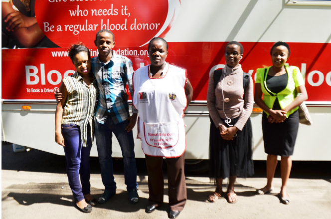
Chromo Campus Students and Blood Donation officials