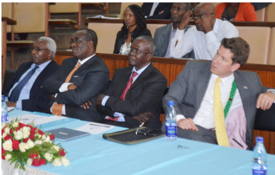
Honored Guests attentively listening to the Lecture