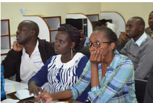
CBPS Students in attendance at a PhD Defense