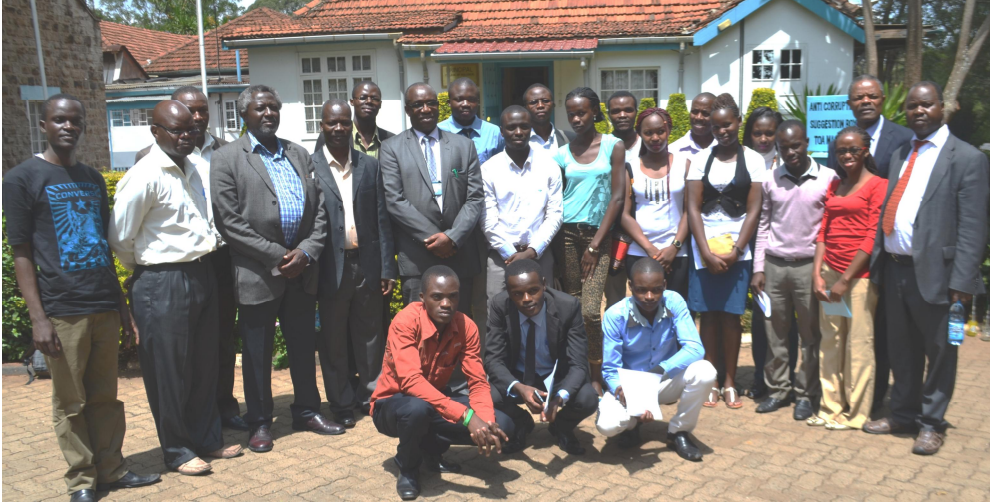
ONUSU Officials pay a courtesy call to the Principal and the Registrar after being sworn in. On the right – handover Ceremony by ONUSS officials