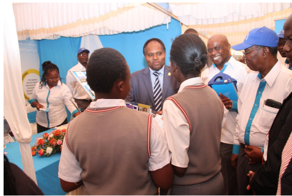
The Vice Chancellor Interacts with Students