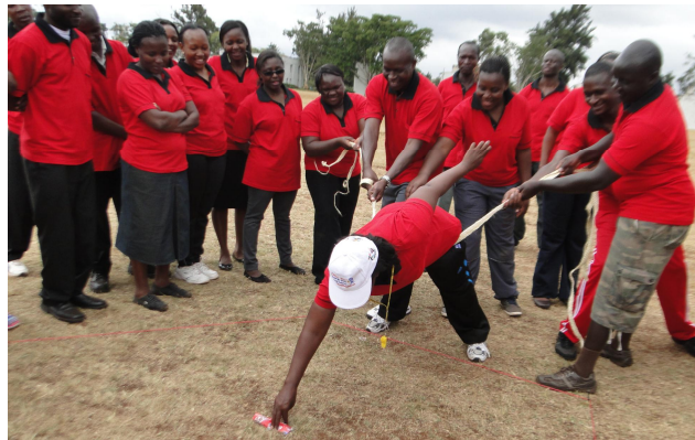
CBPS Team attend team building