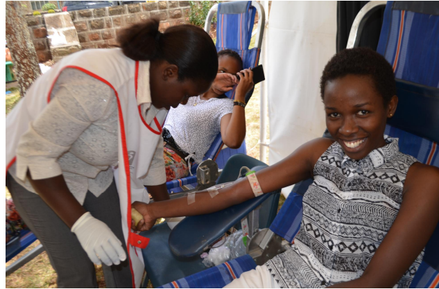
Students Donating Blood