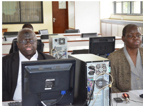
CBPS Academics being sensitized on Google Scholar