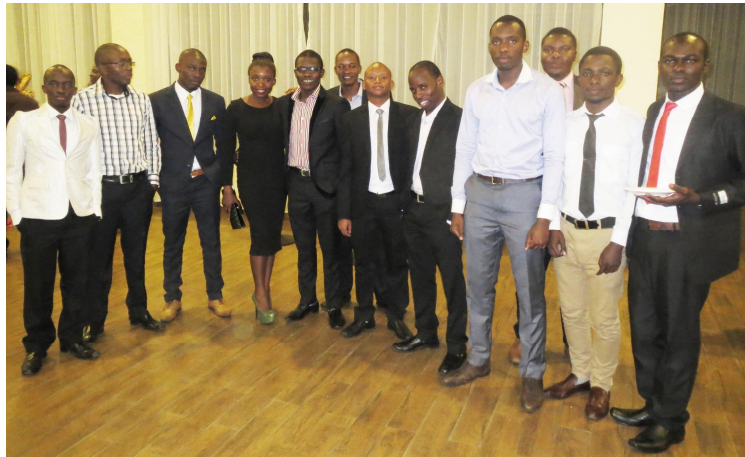
Nairobi University Computer Science Students Association (NUCOMSSA) Members attend dinner at a Nairobi hotel