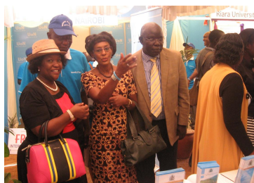
DVC/RPE with guests at the Sarit Centre stand