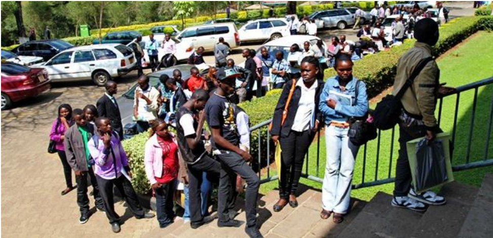
Students reporting at the "Ever-green" Chiromo Campus

You cant stop the waves but you can learn to surf— John Kabat