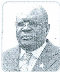
Prof. George A. O. Magoha, Vice-Chancellor