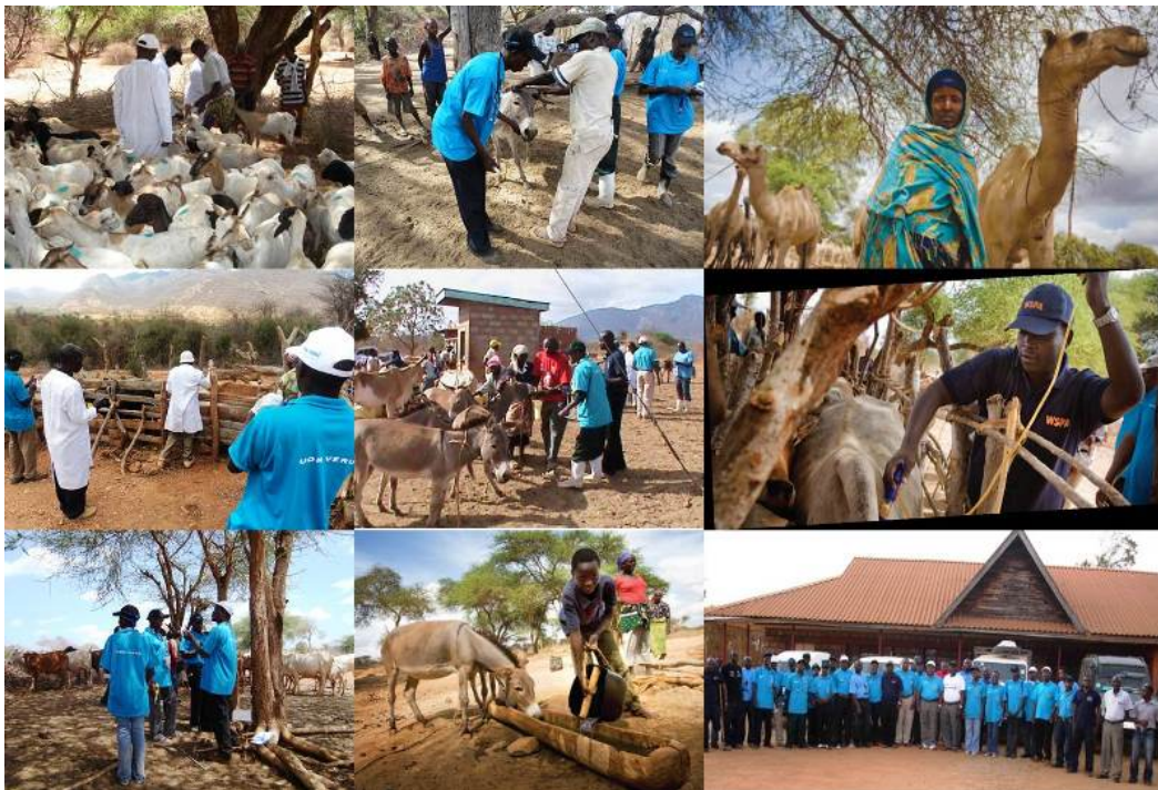
Figure 3: DART teams during disaster management operation

Five DART teams were formed with a central control base located within Mwingi Central. Each of the team was tasked to deal with a sub-county within the area. Teams 1-5 were deployed in Kyuso, Mumoni, Tseikuru, Mwingi Central and Mwingi East (Fig. 3).