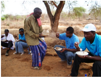
Figure 4: A happy farmer sharing a meal he prepared for team 3 in Tseikuru

Community ownership of the project was manifested when two of the stolen mineral blocks were traced brought back by community members, who took it upon themselves to investigate and identify the culprits.