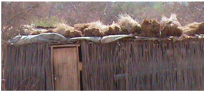
Figure 5: Grass hay collected from hills and used to feed livestock at watering points

Effective feeding of livestock at watering points was continuously ensured by contracted women groups, who purchased and supervised the feeding of animals using grass hay collected locally from the nearby hills (Fig 5).