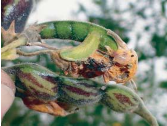
Blue Butterfly larvae on flowers and young pods