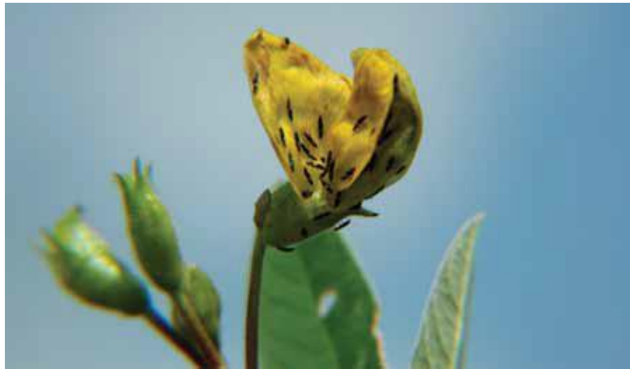
Thrips on florets