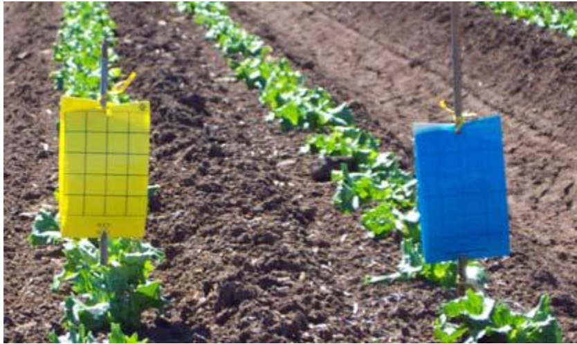
Yellow and blue traps for adult flying insects

Pheromone trap for trapping adult insects, specific to insect and sex