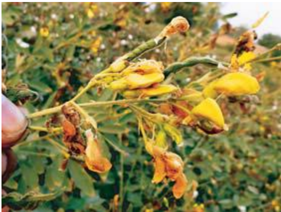
Maruca damage on flowers