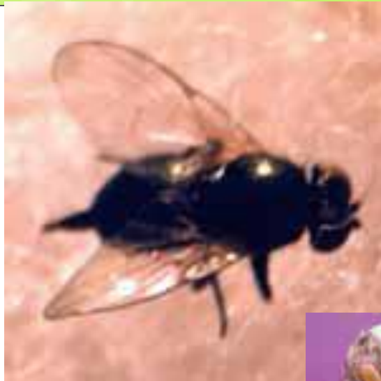
Pod fly adult