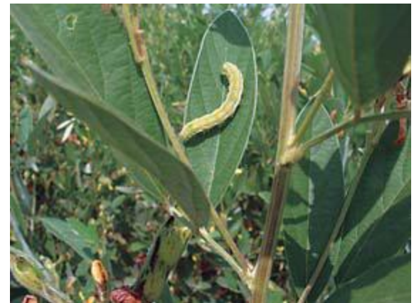
African bollworm on pod and damage