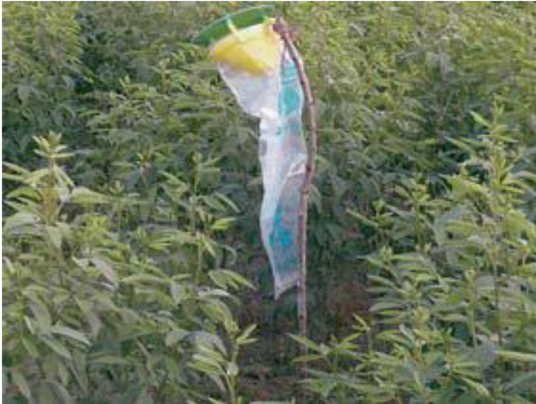
Pheromone trap in a pigeon pea crop