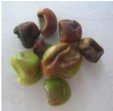
Pod bug damage