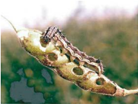
African bollworm on pod