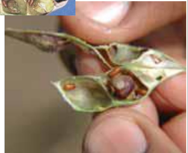
Pod fly pupae