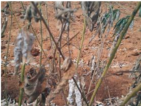
Death due to infestation