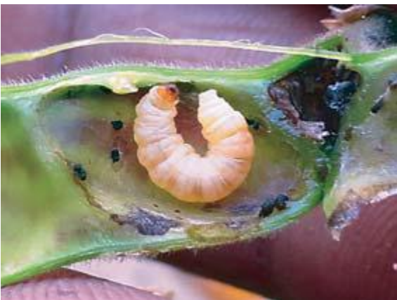
Leaf folder in pod and folded leaves