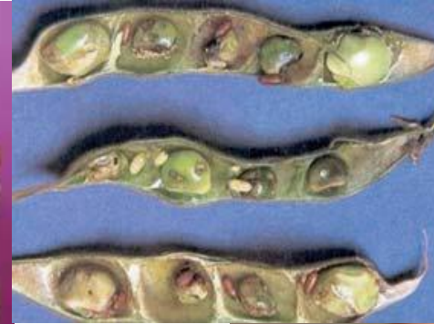
Pod fly maggots