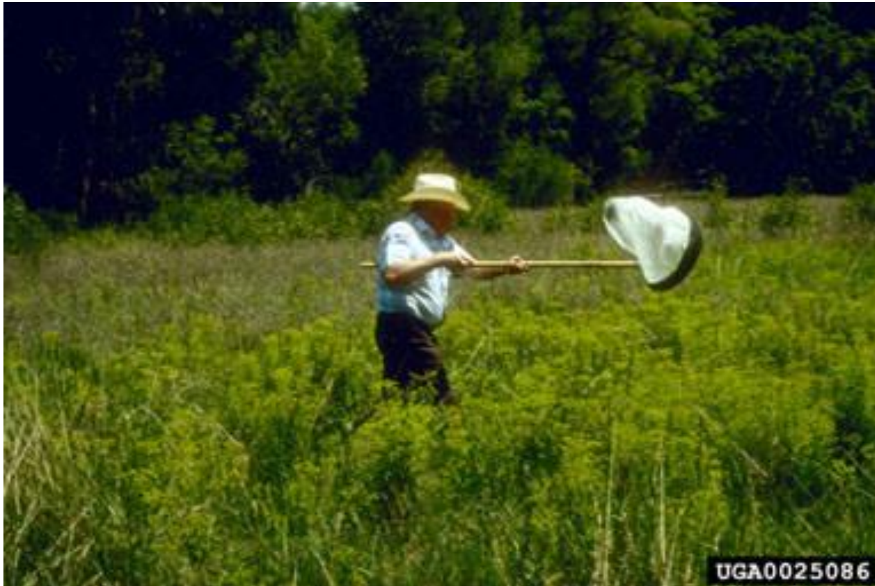
Sweep net sampling for insects