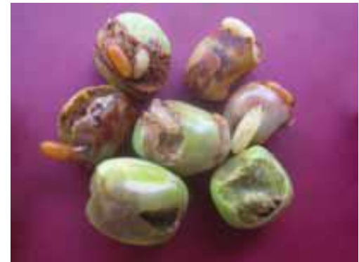
Pod fly damage