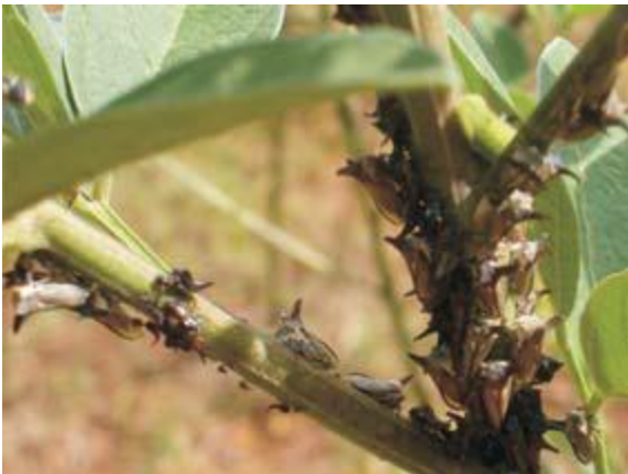
Cow bugs –a sucking bug