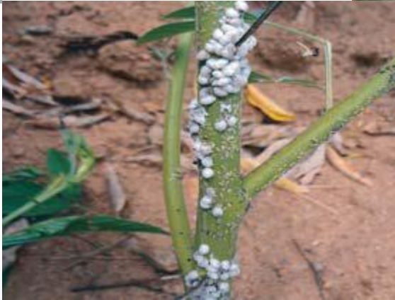
White scales on the stem