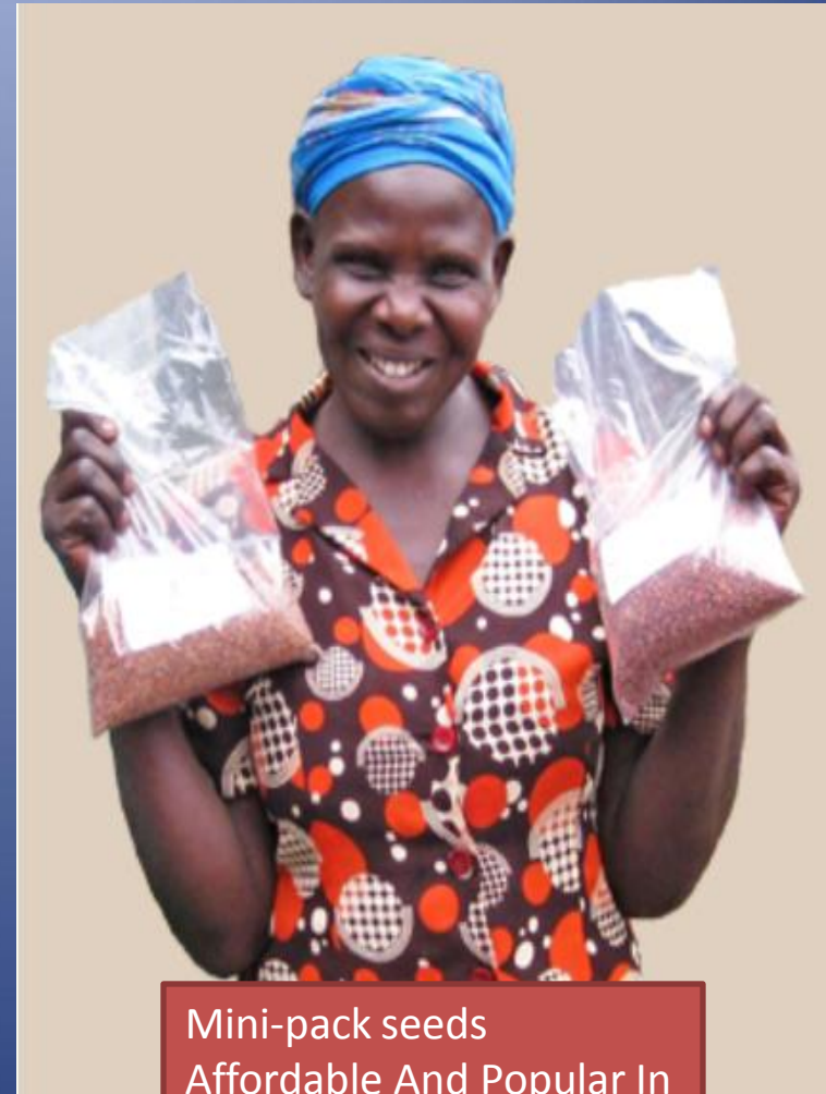
Mini-pack seeds Affordable And Popular In West Africa