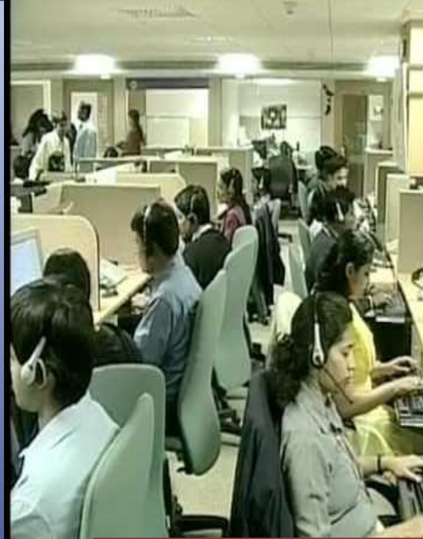
India commodity market