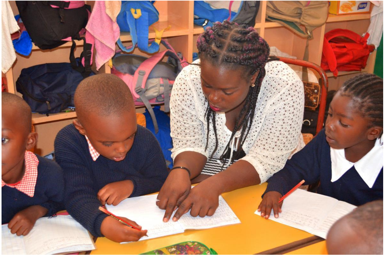
Students from Western Carolina University taking the little young ones through one of the lessons meant for Kenya Science Campus, Nursery School Teacher