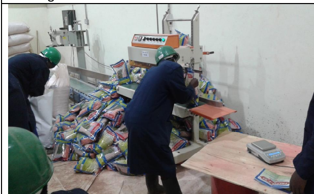
Packaging of maize seeds on-going at SEMIs factory