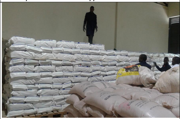
Processed Seeds at SEMIs warehouse