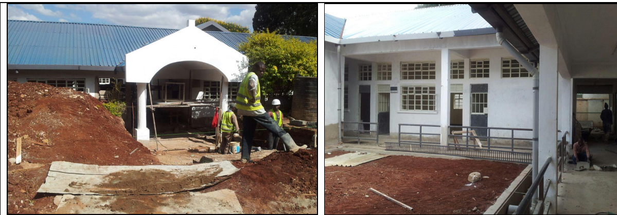
Phase II consisting of labs, offices and classes- Finishes and fitting works remaining

Phase II which consist of Laboratories and offices is 90% complete with finishing works remaining to be completed by the contractor.