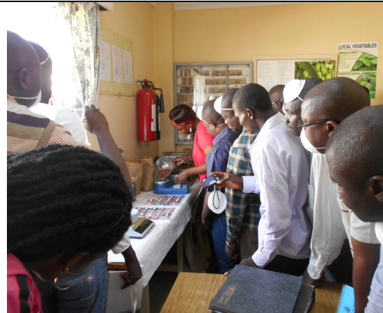
Participants at the Seed Quality laboratories at Kenya Seed Company, Ruaraka.