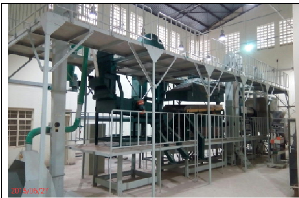
Installed seed processing plant in SEMIs factory building

The SEMIs project completed Installation of its seed processing machines comprising of corn sheller air-screen cleaner, gravity separator, seed treating machine and packaging machine in August 2015. The factory began offering processing services to other small seed companies for which Elgon Kenya Limited is among such companies. So far 88.48 tonnes of seed maize and 10 tonnes seed beans has been processed and packaged at SEMIs Seed processing factory. This service provision to smaller seed companies is one of the key sustainability mechanisms of the Institute.