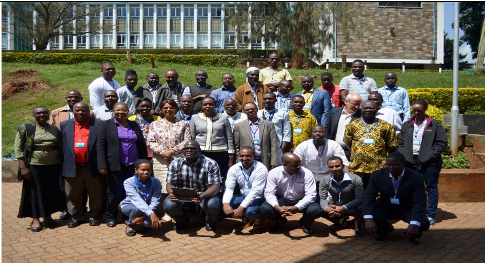
Participants of Seed Business Management in group photo with AGRA president at CAVS